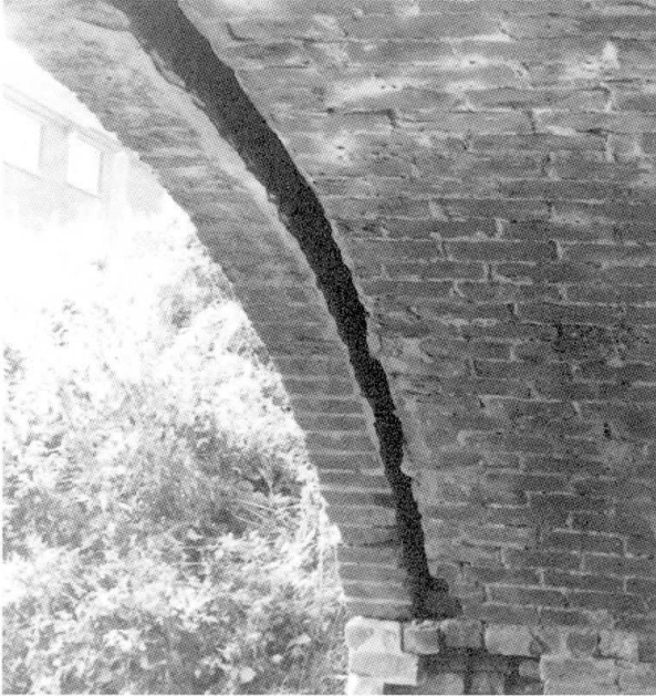
Fig 2 Crack in arch ring

Spandrel walls stiffen the arch ring at its edges. Flexing of the arch ring due to traffic loads will produce shear stresses in the ring where the relatively flexible part with only fill above it is stiffened by the spandrel wall, and these stresses may result in a crack. A severe example of such a crack is shown in figure 2. This type of failure may be assisted by rainwater getting into the structure at the parapet/surface joint and causing particular damage to the arch ring mortar where the spandrel wall meets the ring.