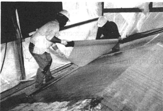
Fig. 1 Installation of Carbon Fiber Fabric

Extensive testing was conducted prior to installation, particularly to determine the modulus of elasticity of the composite membrane. Stiffness, not strength was the chief characteristic sought after in the design. Test specimens showed a compressive modulus of E = 34 \text{ mPa} .