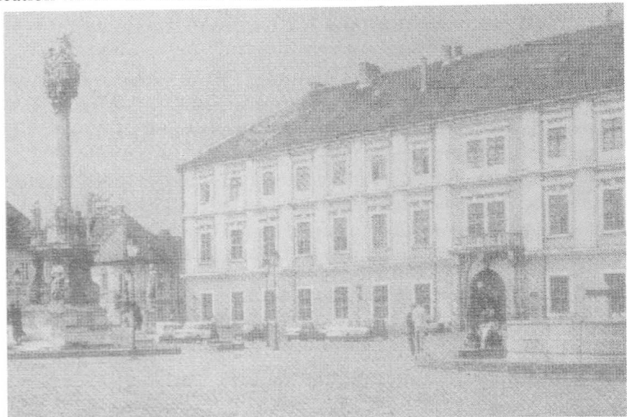
Fig 3. Main Tvrda's square

Thanks to the military fortification which has caused Tvrda's isolation and solitude from the other town parts, the historic treasure, their typology, architecture, ambient and structural characteristic is preserved. In order to preserve their authenticity and historic value, it is necessary to evaluate, systematize and validate the buildings in their whole and particularity (materials used, construction technology, structural type).