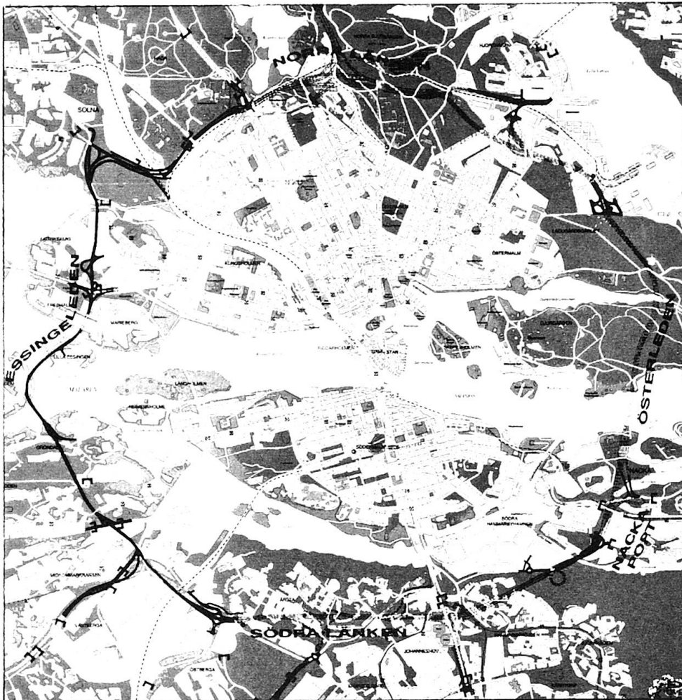
Figure 2 The planned motorway ring around Stockholm

In Stockholm, after many years of preparation and political discussions works have now been initiated on the Southern Link (Södra Länken) of the motorway ring around Stockholm. See Figure 2.