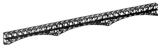
Fig. 3 FEM model