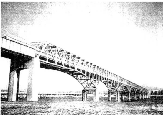
Fig. 1 The Dangsan bridge

The bridge consisted of three units of three-span-continuous steel Pratt truss with length 90-90-90m for its main spans in the middle and plate girder bridges on both ends. The picture, profile and corresponding FEM model are depicted in Fig. 1, 2, and 3, respectively. The bridge was made to serve the subway traffics only, and was experiencing about 510 trains daily in two way system.