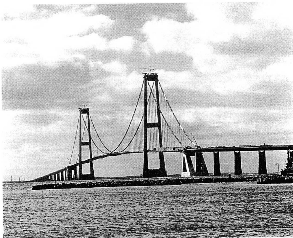
Fig. 1: East Bridge 1998