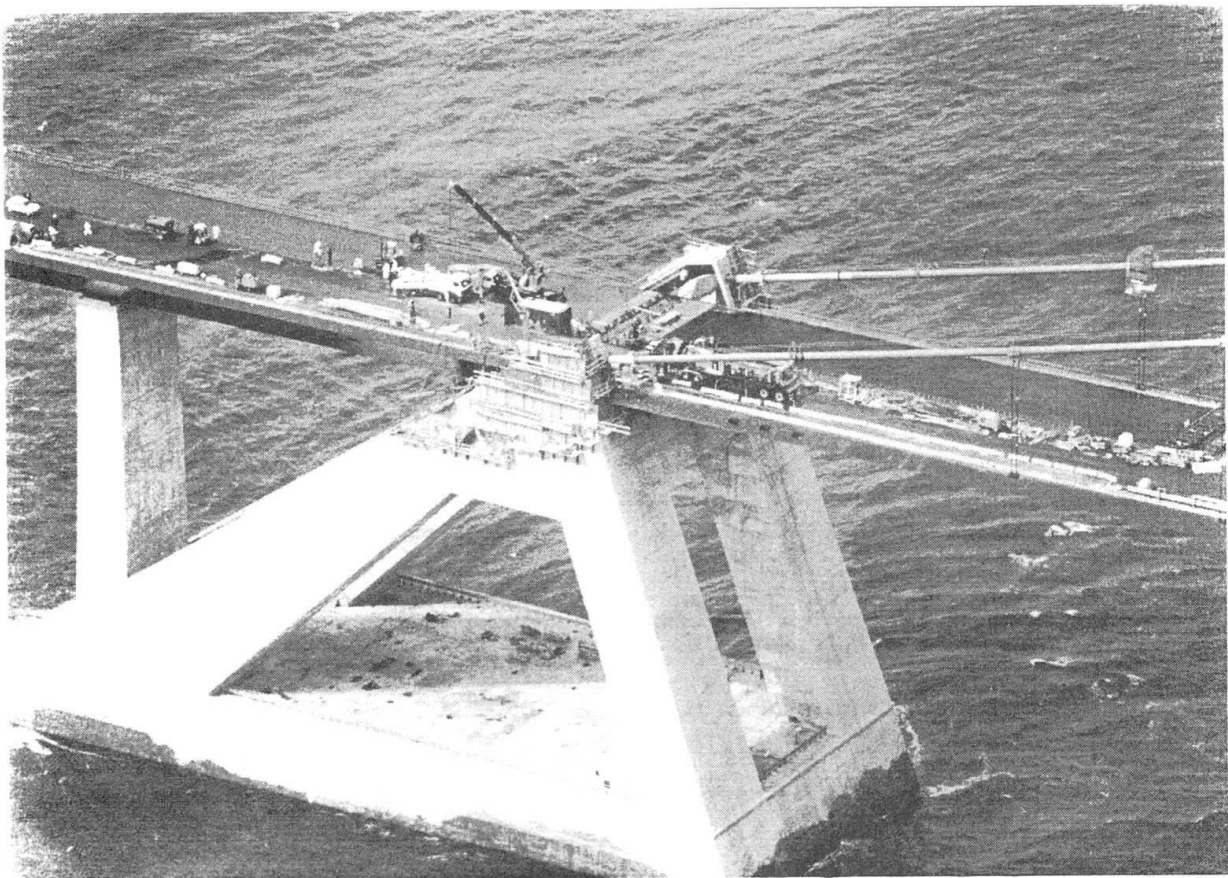
Fig. 2: Anchor Block

Several different geotechnical analyses were performed in relation to the anchor blocks as reported by T. Feldt (1996). These calculations and the FEM analysis of the anchor blocks proved that the stiffness of especially the centre part of the anchor blocks compared with the assumed stiffness of the soil had a major influence on the position of the reactions from the soil and the stress distribution between the bottom slab and the stonebeds on the rear and front pads of the anchor blocks. The soil conditions had therefore a significant influence on the internal forces in the anchor blocks.