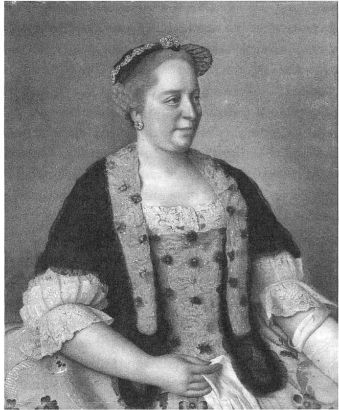
Fig. 3 Jean-Etienne Liotard, Maria Theresa, Empress of the Holy Roman Empire (1717-80), 1762, pastel on parchment, 890 × 725 mm.