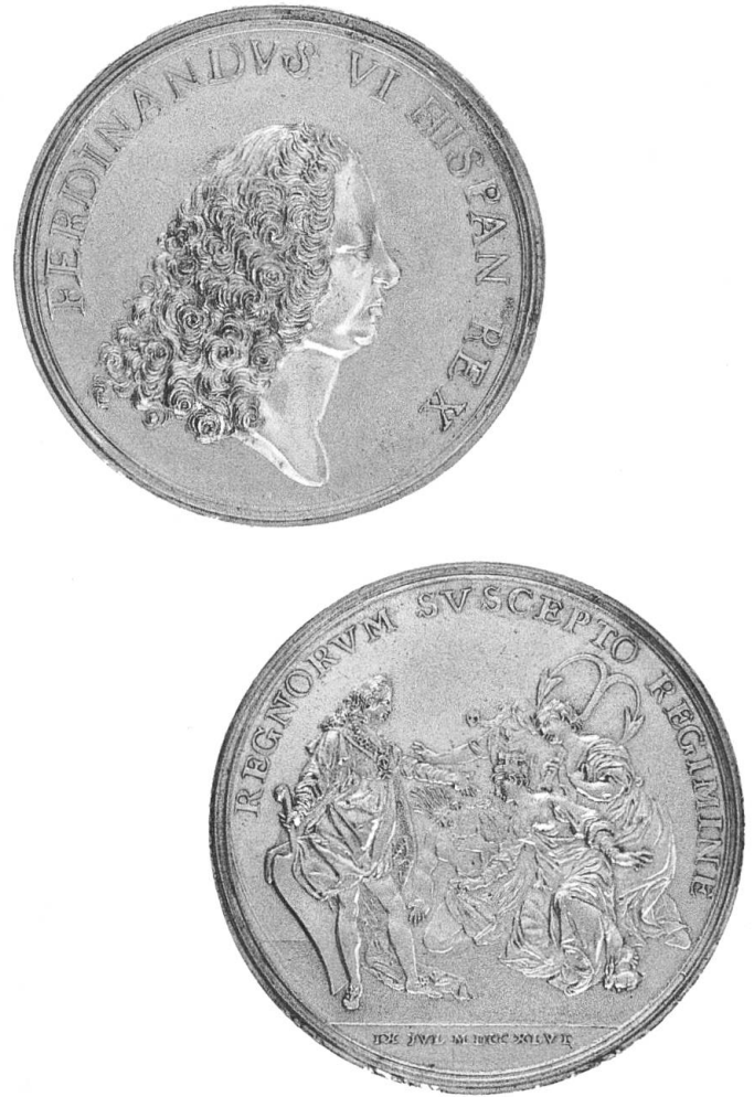
Fig. 2 Carlos Casanova, Ferdinand VI, King of Spain (1713-59), takes possession of the kingdom, 1746 , silver, 52 mm. © Madrid, Museo Nacional del Prado, inv. no. 001236

In Spain as in every European court the medal commemorating the commencement of a reign was a work of primary political and diplomatic importance. The acceptance of Dassier's work as the official medallic image of the new king reflects the court's appreciation of Genevan expertise. No doubt Ensenada was especially impressed by the medal and sought to employ it within his program of reform in the arts, sciences and manufacture. Its appearance in Madrid at this critical moment undoubtedly influenced his decision to extend an invitation to Dassier's friend Jacques-François Deluc three years later.