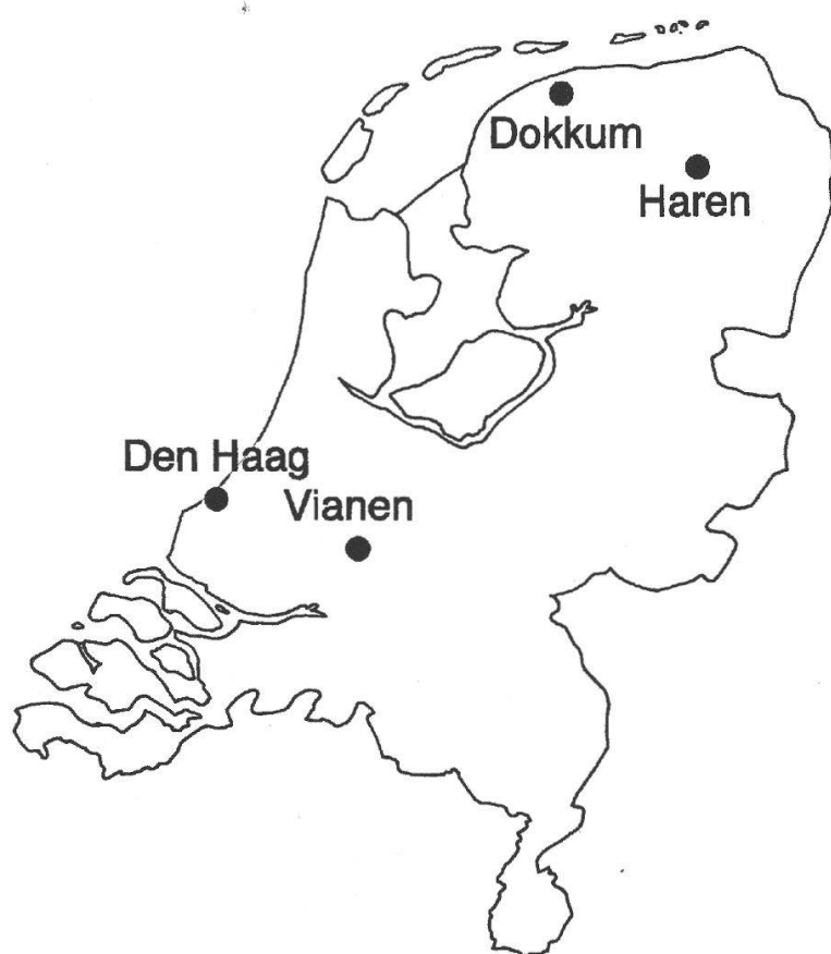
Fig. 2 - Map of The Netherlands, showing locations of spider exhibitions.

Prey capture was displayed in show-cases by preserved spiders (showing the size of the spiders), together with photographs of the same spiders alive (showing colours), and photographs of their ways of catching prey. The building of orbwebs was demonstrated by computer graphics. In vivaria some Dutch spiders, caught by the author, were shown, like water spiders ( Argyroneta aquatica (Clerck)), wolf spiders ( Pardosa amen-tata (Clerck)), Pirata sp.), daddy-long-legs spiders ( Pholcus phalan-gioides (Fuesslin)), jumping spiders ( Salticus