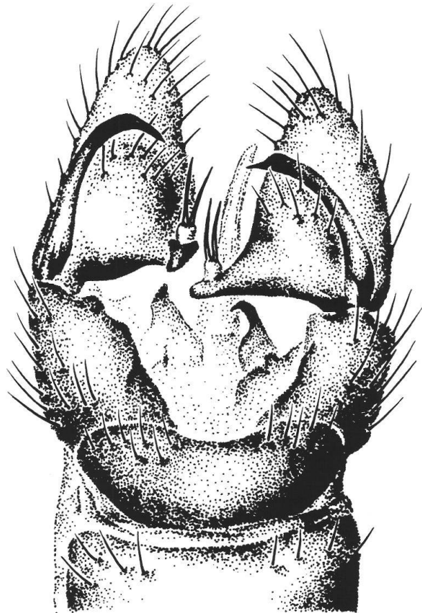
Figures 1-3: Rhipidia (? subgen.) zyza spec. nov. , holotype: 1. wing venation; 2. antenna; 3. male genitalia, dorsal view.