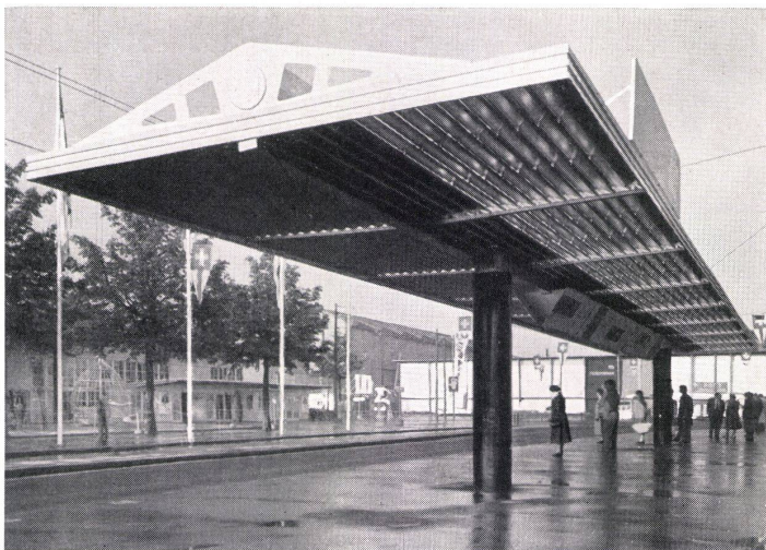
Perrondach vor dem Mustermessebau, Basel