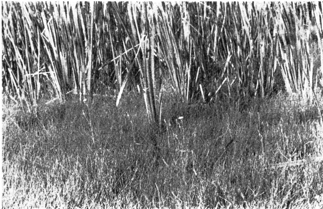
FIG. 43. — Dense basal tufts of T. elephantina . In the forefront are: Cyperus laevigatus and Sonchus maritimus .

(1889) in their enumeration of Egyptian plants, although that list was meant to give a complete account of what was growing in Egypt. The plant was rediscovered in Wadi Natroun by SICKENBERGER (1901). Later it is frequently mentioned by authors dealing with the Egyptian flora (MUSCHLER, 1912; STOCKER, 1927; SIMPSON, 1930, 1937; TÄCKHOLM & DRAR, 1941; TÄCKHOLM & al., 1956).