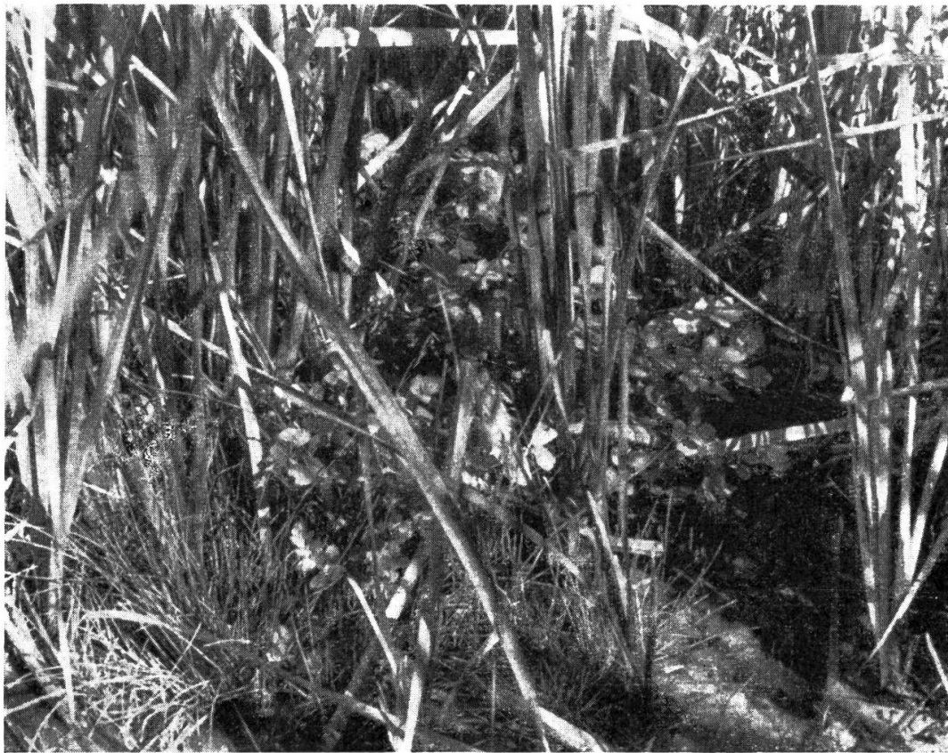
FIG. 44. — Inside the T. elephantina zone, with prominent keeled leaves, growing along with Cyperus laevigatus and Berula erecta .

GRAEBNER (1900) places T. elephantina in the Section Bracteolata Kronf. and gives the following references and synonyms: