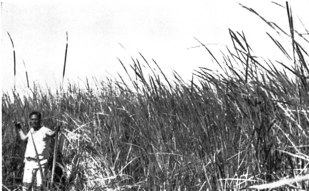
FIG. 42. — A mixed stand of Typha elephantina (left) and T. australis .