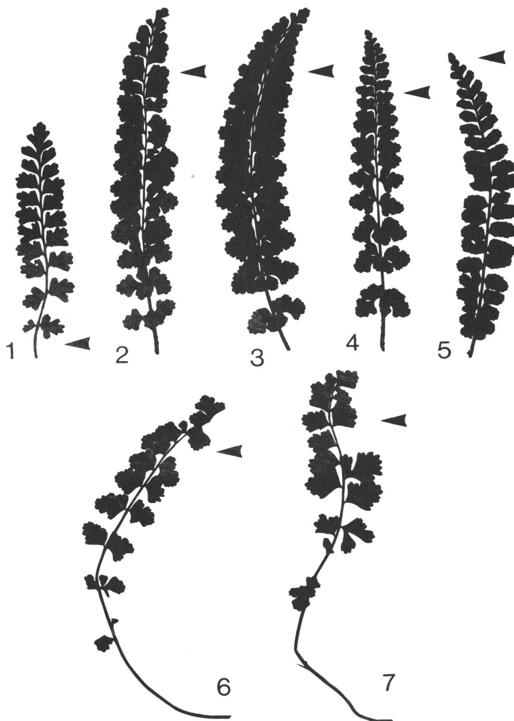
Fig. 1-7. — Silhouettes of fronds in natural size. 1-5, from cultivation at Leeds (plants originally collected on Mt Hagios Pnevma); 6-7, from plants collected in the wild. 1, Asplenium creticum (PJB C53); 2-4, A. \times khaniense (PJB C55); 5, A. trichomanes subsp. quadrivalens (PJB C57); 6-7, A. \times khaniense (J9149). The arrows indicate the position where the colour of the rachis changes from brown below to green above.