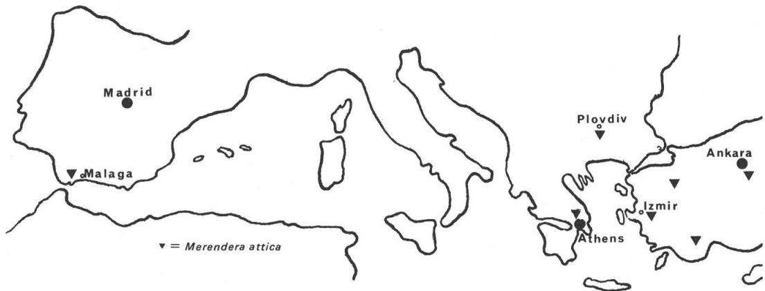
Fig. 7. — Distribution map of Merendera attica showing the new locality in Spain and the more widespread localities in Greece and Turkey.