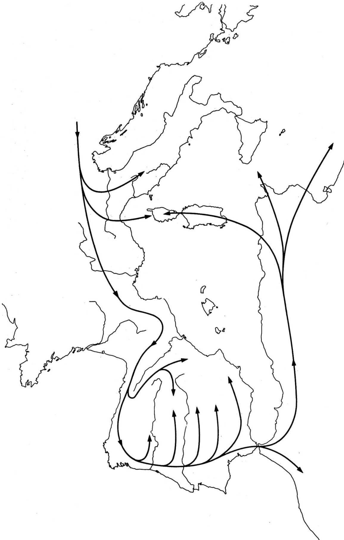
Fig. 2. — Model for the migration of orophytic plants in the western Mediterranean during the salinity crisis.