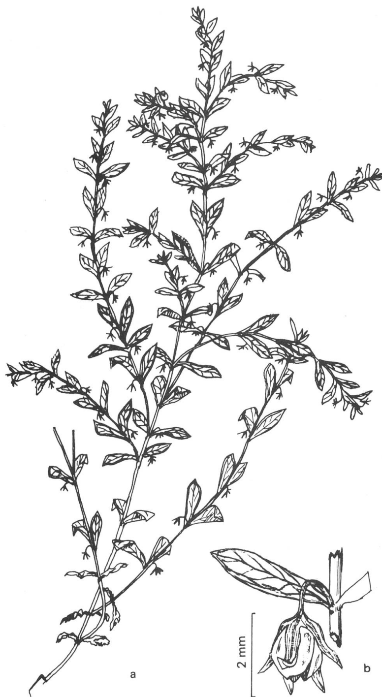
Fig. 1. — Pelletiera wildpretii (ORT 12796). a , general aspect (natural size). b , calyx and capsule.