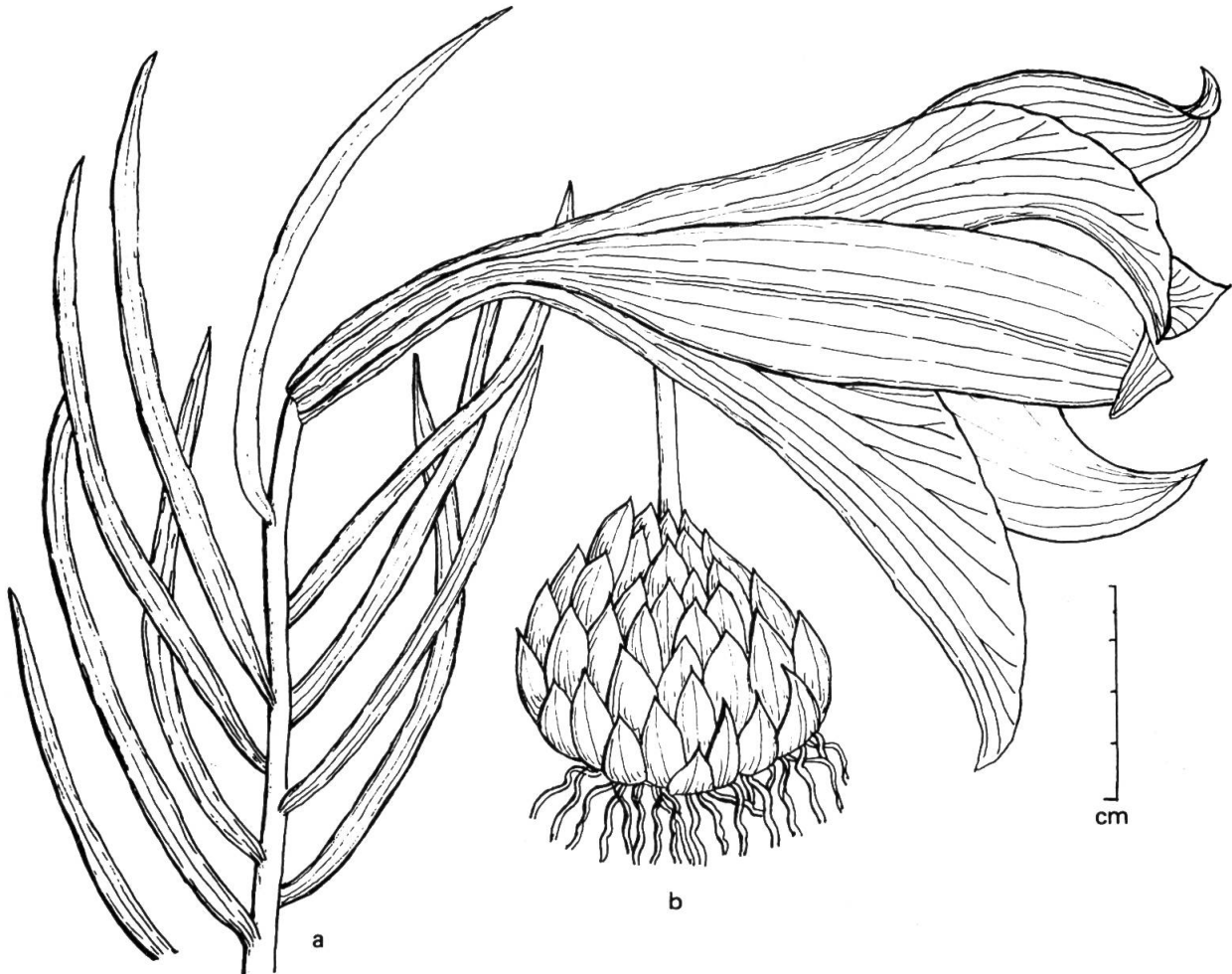
Fig. 2. — Lilium wallichianum Schultes f. a, flowering twig; b, bulb.

Leaves 5-14 × 0.8-2 cm, lanceolate, or linear-lanceolate. Flowers creamy white. Filaments 10-17 cm, anthers 1.5-3 × 0.2-0.25 cm. Ovary sessile, 30-40 × 2-4 mm, linear. Flowering: June-December.