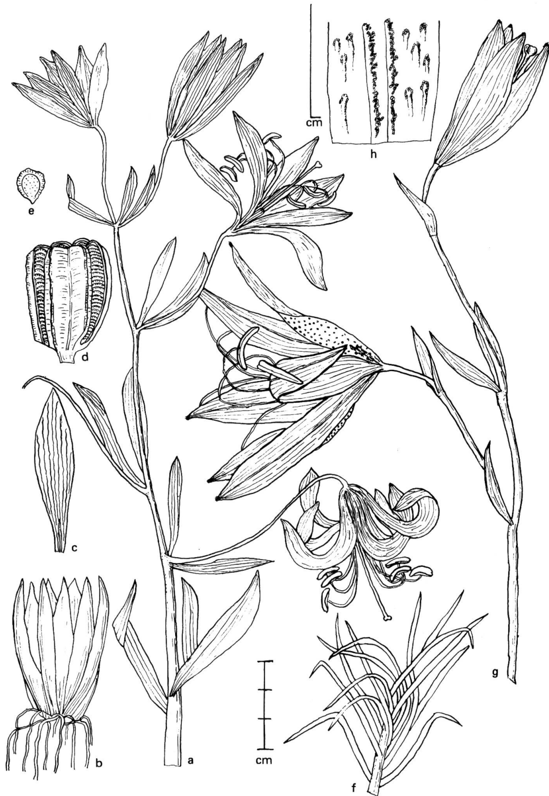
Fig. 4. — Lilium polyphyllum D. Don a, flowering twig; b, bulb; c, perianth segment; d, capsule; e, seed. Lilium davidii Duchartre f, leaves; g, flowering twig; h, nectaries with processes.