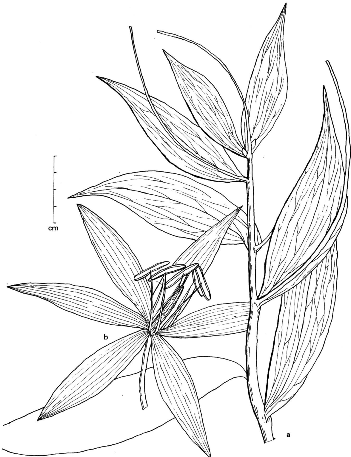
Fig. 7. — Lilium arboricola Stearn a, leafy twig; b, flower.