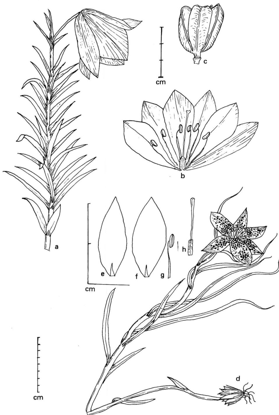
Fig. 6. — Lilium mackliniae Sealy a , flowering twig; b , flower showing different parts; c , capsule. Lilium sherriffiae Stearn d , plant; e , outerperianth; f , innerperianth; g , stamen; h , pistil.