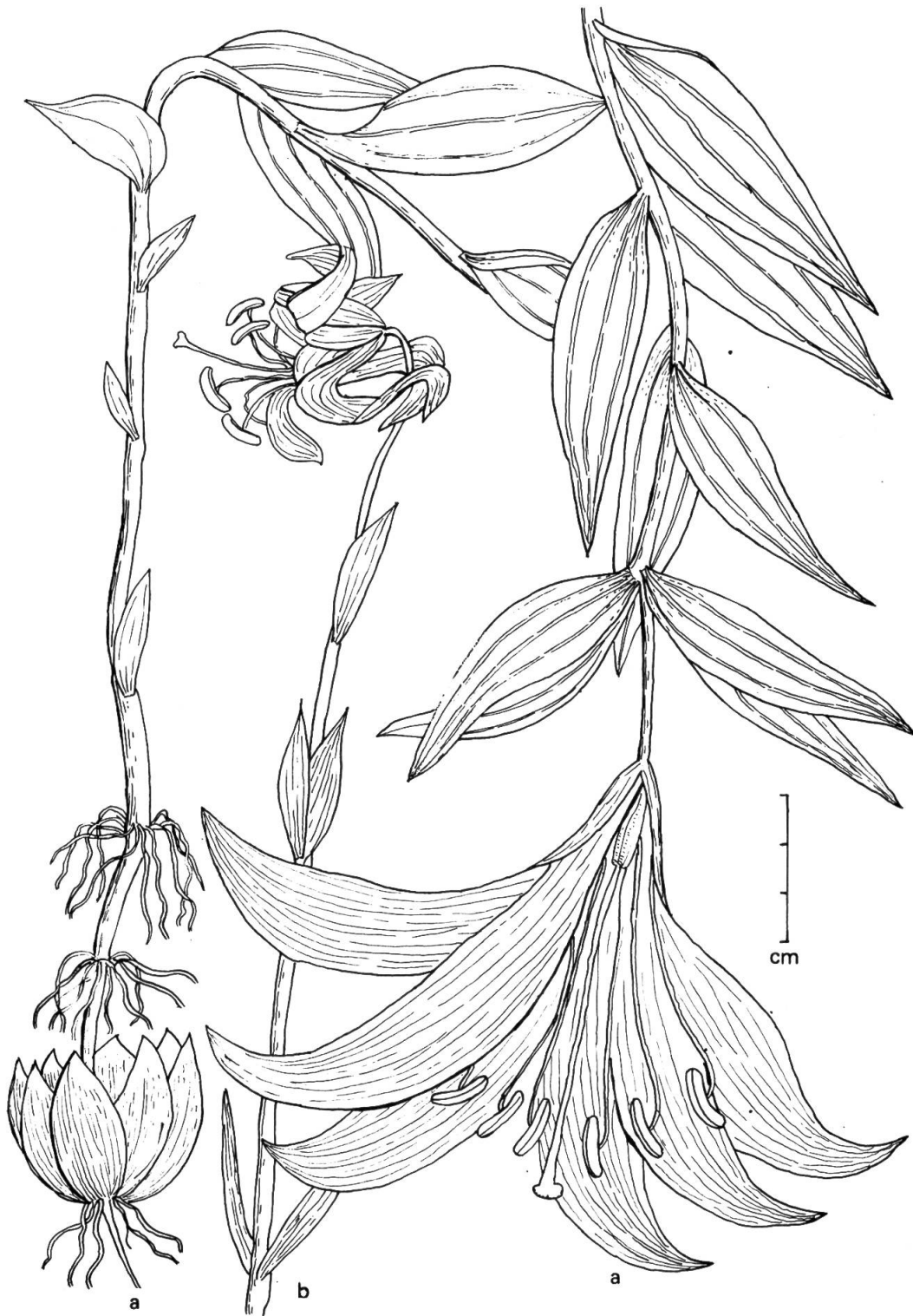
Fig. 5. — Lilium primulinum Baker a, plant with bulb, leaves and flower showing different parts. Lilium duchartrei Baker b, flowering twig.