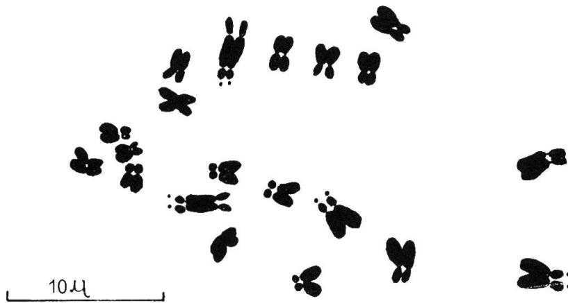
Fig. 2. — Mitotic chromosome plate of Cremnophyton lanfrancoi .

vegetation must be referred to Triadenio-Chiliadenetum bocconeii , a rupestrian association described by BRULLO & MARCENO (1979), which is endemic of the Maltese Archipelago.