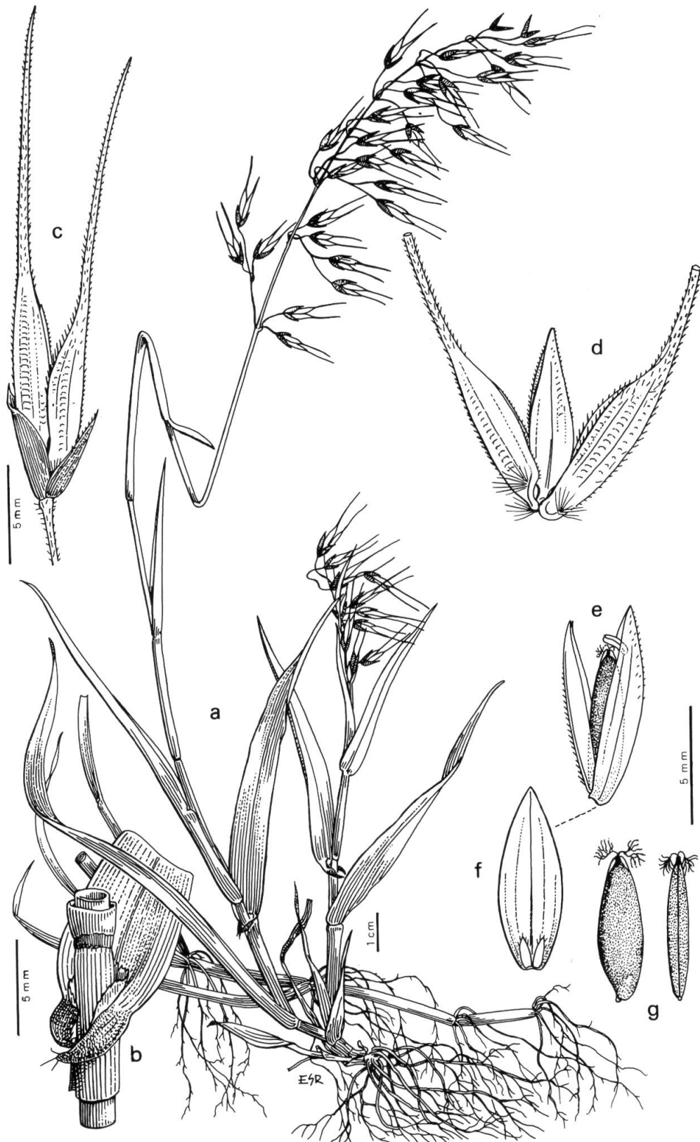
Fig. 1. — Ehrharta longiflora Sm.

a, whole plant; b, leaf-sheath, ligule and lower part of leaf; c, spikelet; d, the three florets of spikelet; e, central fertile floret; f, lemma and lodicules; g, ovary.