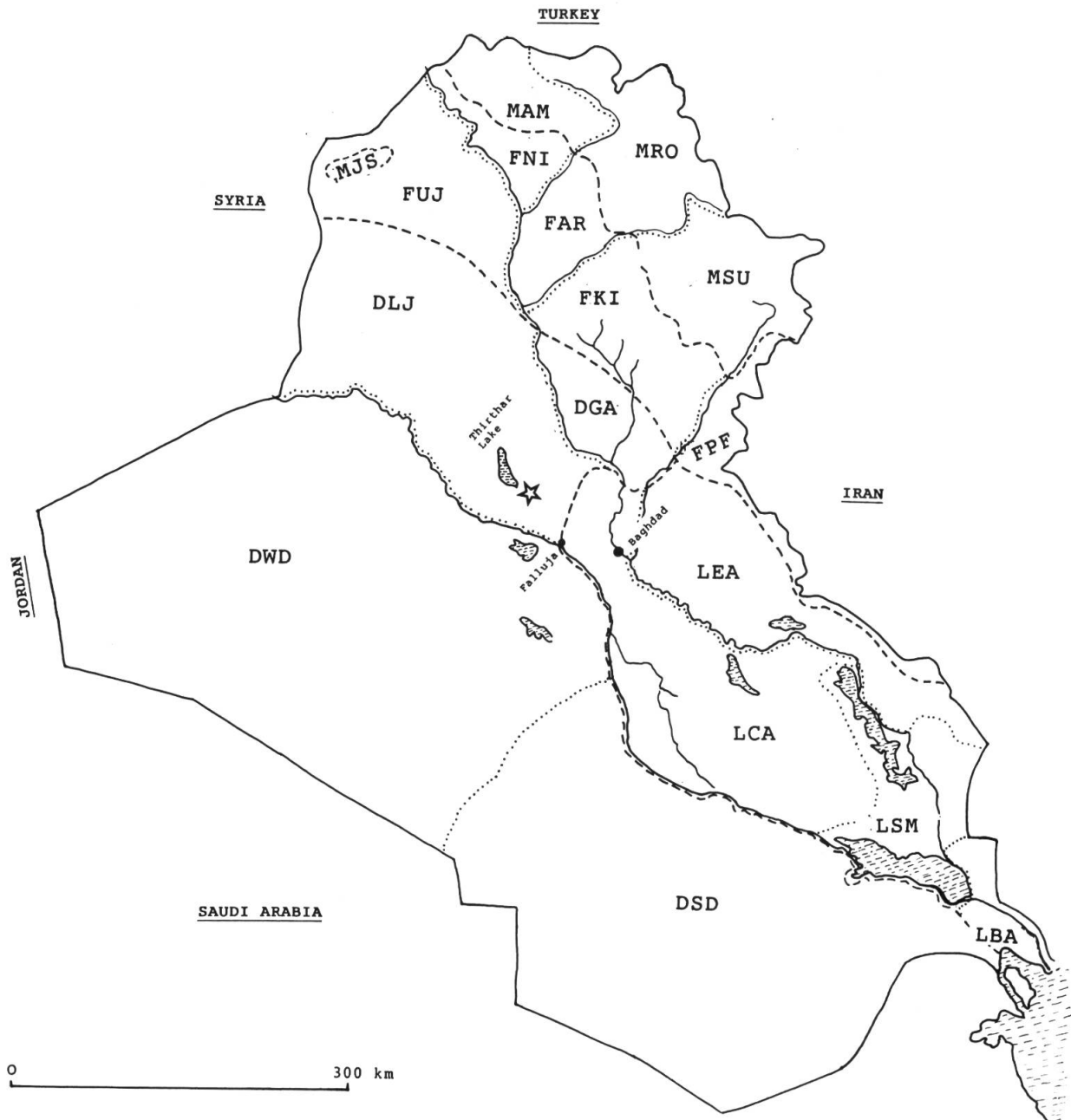
Fig. 2. — Distribution of Calligonum mejidum in Iraq.