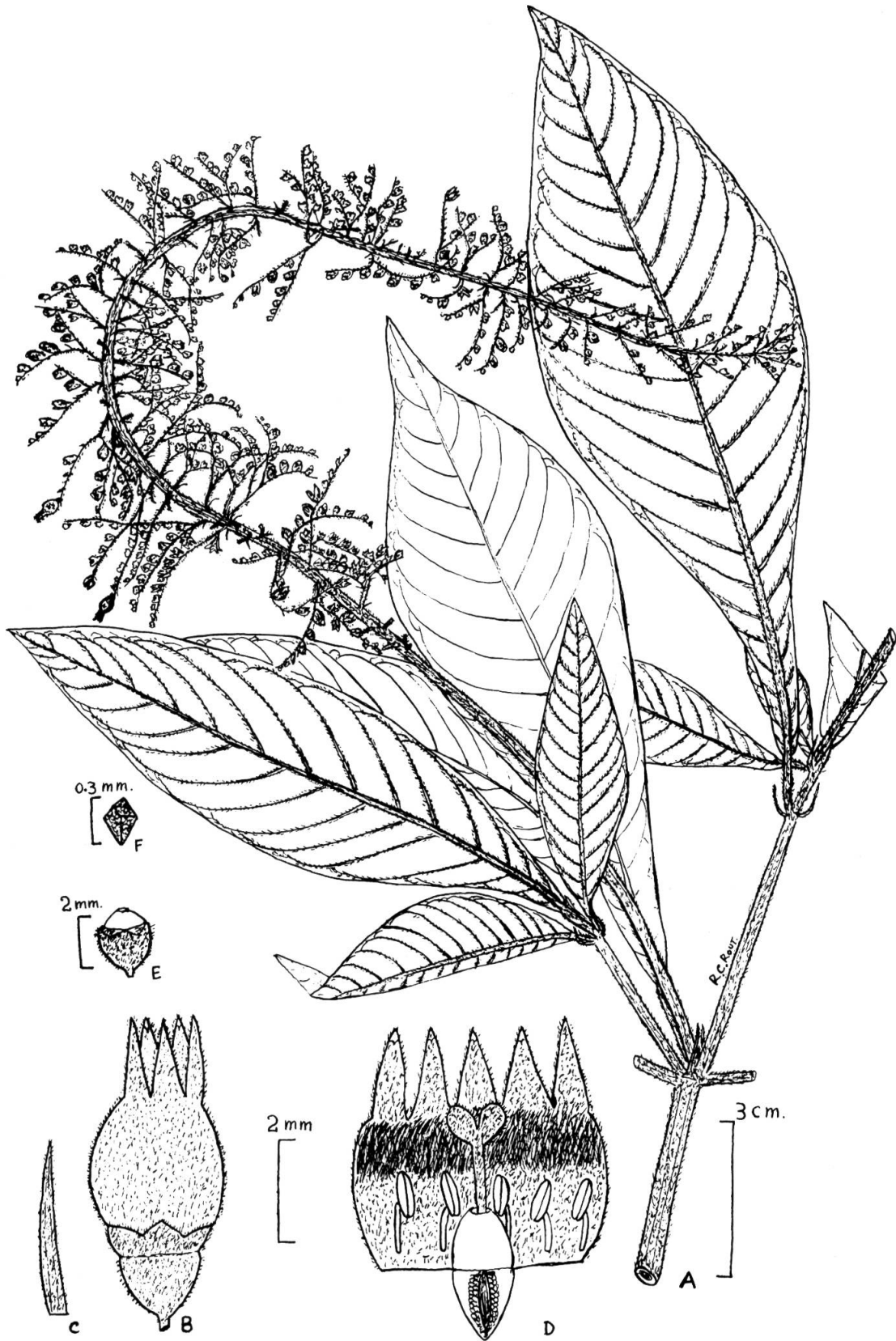
Fig. 2. — Spiradiclis seshagirii Deb & Rout, spec. nov. A, habit; B, flower; C, bract; D, flower split opened showing floral parts; E, fruit; F, seed.