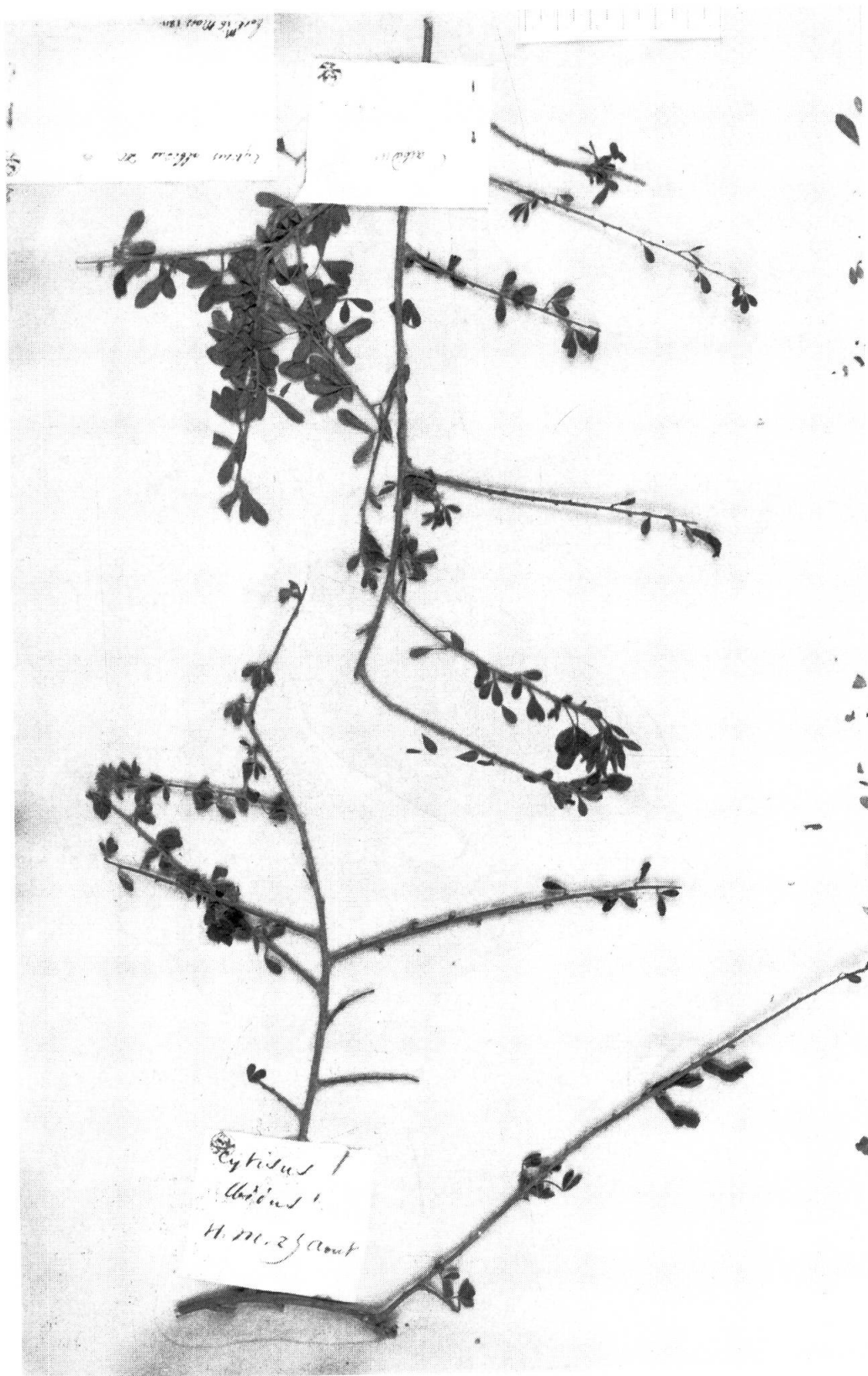
Fig. 2. — The lectotype of Cytisus albidus DC. (G without number, herb. DC.). The specimen placed on the right top was selected as lectotype.