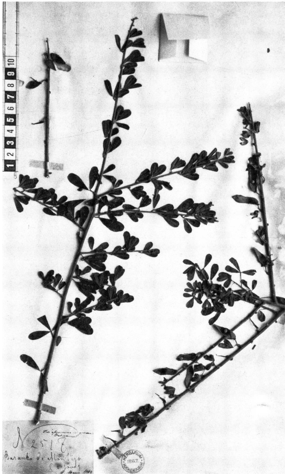
Fig. 3. — Specimen of Chamaecytisus mollis (Cav.) Greuter & Burdet (= Cytisus albidus DC.) apparently collected in "Barranco de Montijo... Tenerife" which represents the only known evidence on the occurrence of this species in the wild in the Canary Islands. (K, herb. Hook., George Mann 2517).