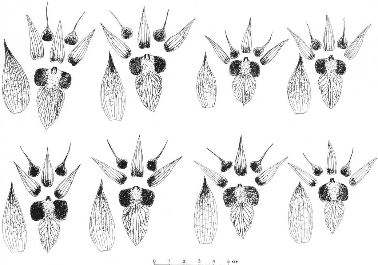
Fig. 2. — Flower variability.