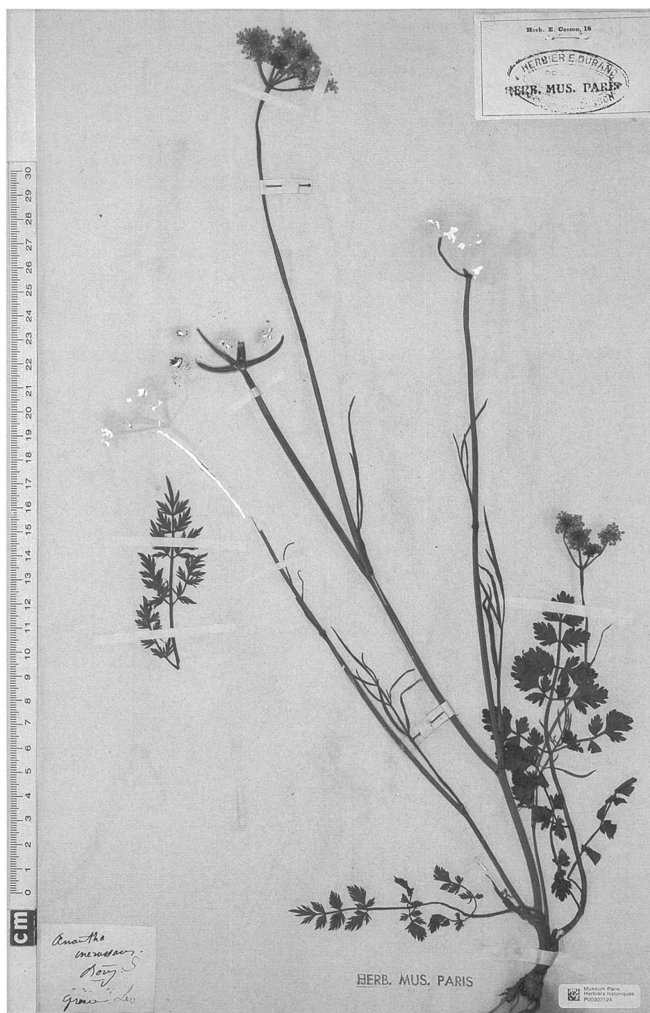
Fig 2. – Specimen of Oenanthe incrassans Bory & Chaub. collected on Bory's expedition to the Peloponnese in 1829 (P).