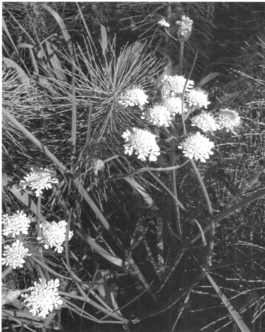
Fig. 1. – Oenanthe incrassans Bory & Chaub. in a wet area near Steno Pangratiou, Peloponnese, Greece.

specimen cultivated in England ex seed collected VIII.1989 from roadside verge near Patras, 15.V.1993, Hanson & Southam (BM); Steno Pangratiou, 11.V.2004, Foley 2010 (E); Corfu: “Insulae Corcyra”, VII.1877, Ball s.n. (E); Kastrades, 9.V.1896 & 4.VI.1896, Baenitz s.n. (E, 2 sheets); Ipsos to Ag. Markos, 16.VII.1972, Davis 54531 (E); Crete: E of Phalassarna, Crete, 20.IV.1973, Burbridge 318 (E); s.loc., 5.VI.1899, Baldacci 21 (BM); Kissamos, 2.V.1884 & 2.VII. 1884, Reverchon 247/2811 (BM), as Oe callosa ; [locality indeciph.], 25.VI.1942, Rechinger f. 14050 (BM); La Canée, lieux humides, 19.V.1883, Reverchon 2812 (BM); Potamies, V.1846, de Heldreich s.n. (E); Kos: between Asphenidou & Ziparion, marshy slope, drying out, 10.X.1981, Davis 67935 (E); Naxos: Kinidaros, 17.VI.1898, Leonis 167 (E); Thasos: Limenas, 19.V, Halácsy s.n. (BM).