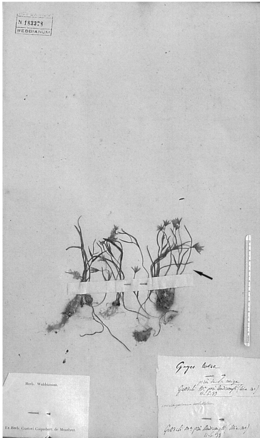
Fig. 1. – Lectotypus of the name Gagea amblyopetala var. elata A. Terracc.

[Gustav Coquebert de Montbret s.n., Fl]