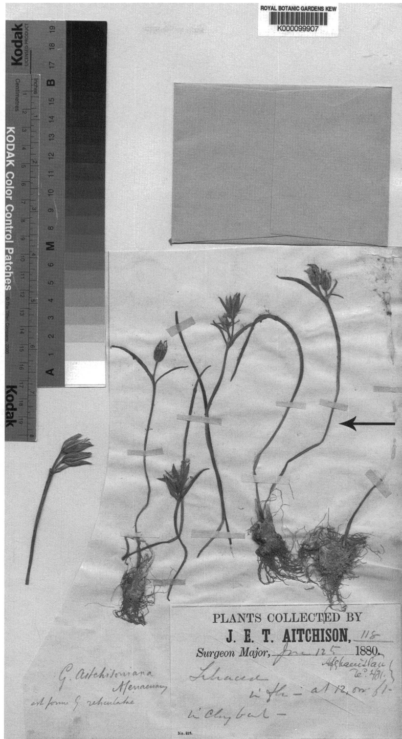
Fig. 2. – Lectotypus of the name Gagea aitchisoniana A. Terracc. [Aitchison 828, K]