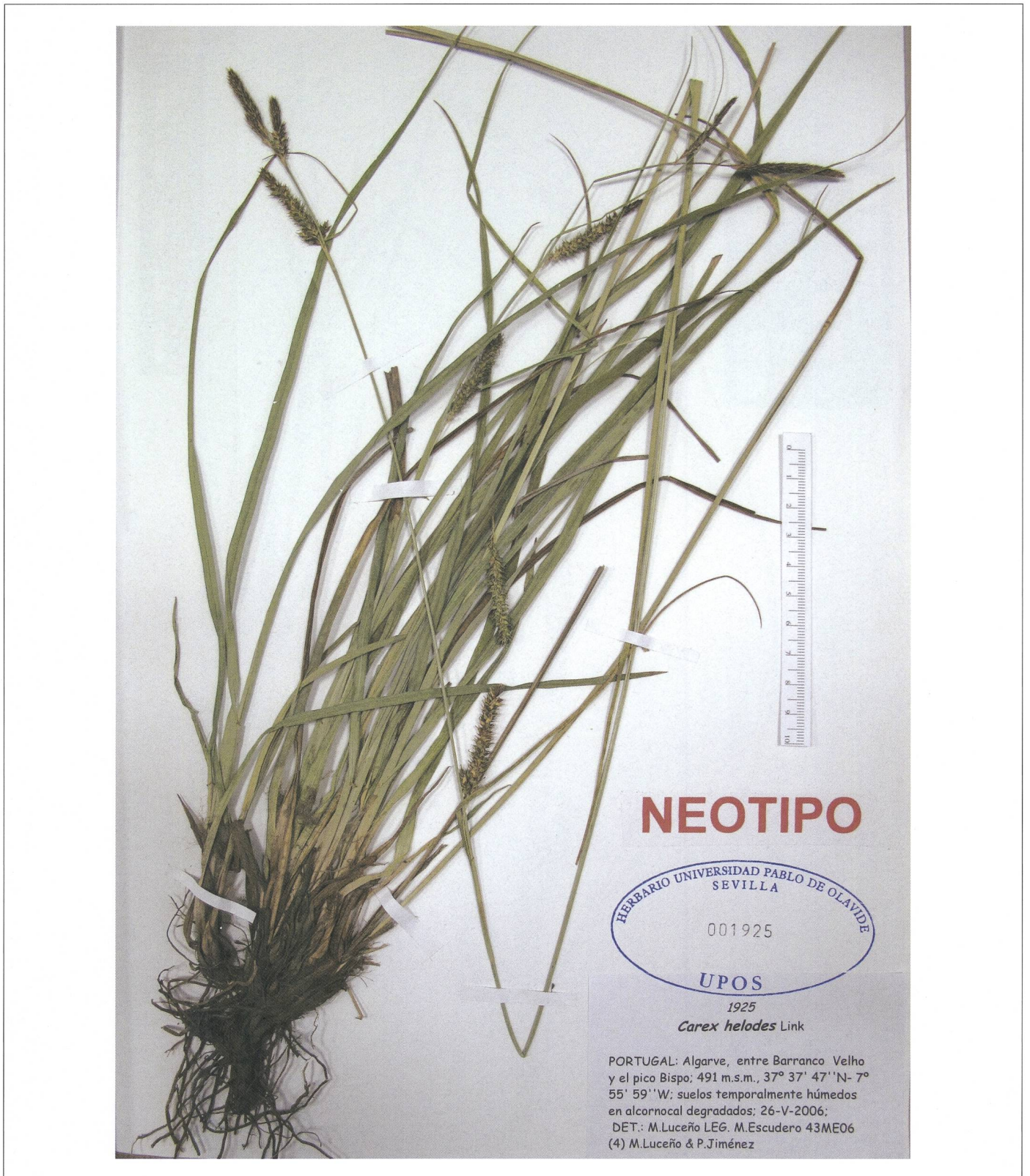
Fig. 1. – Neotype of Carex helodes Link.

[Luceño & al. s.n., UPOS]