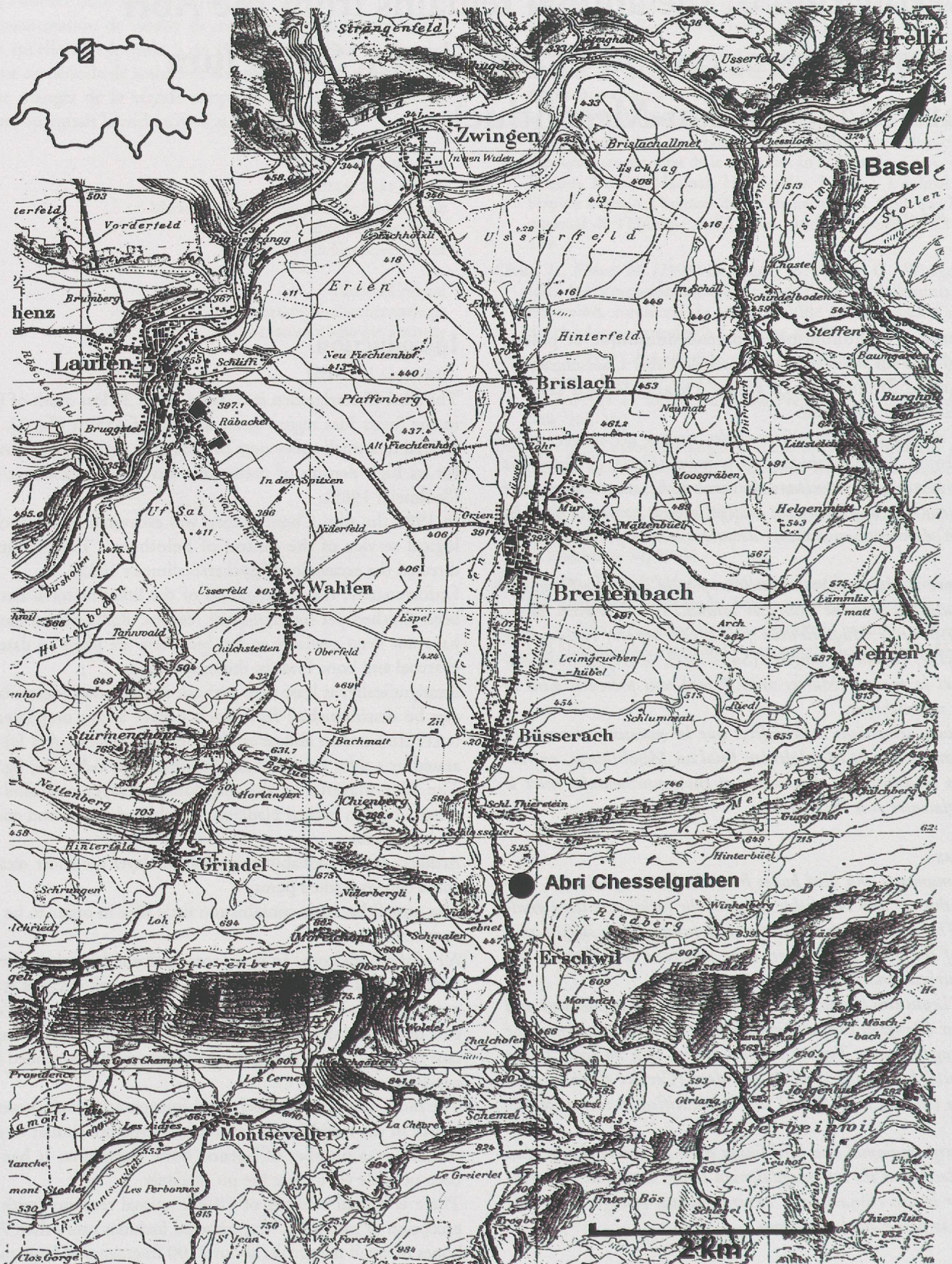
Fig. 1. Abri Chesselgraben. Situation of the site. Scale 1:50.000.