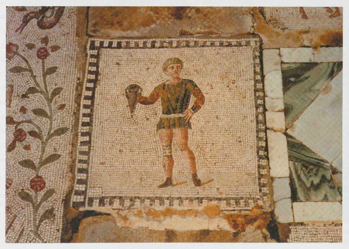
Fig. 4. Mosaic from the Maison des Chevaux at Carthage (detail).