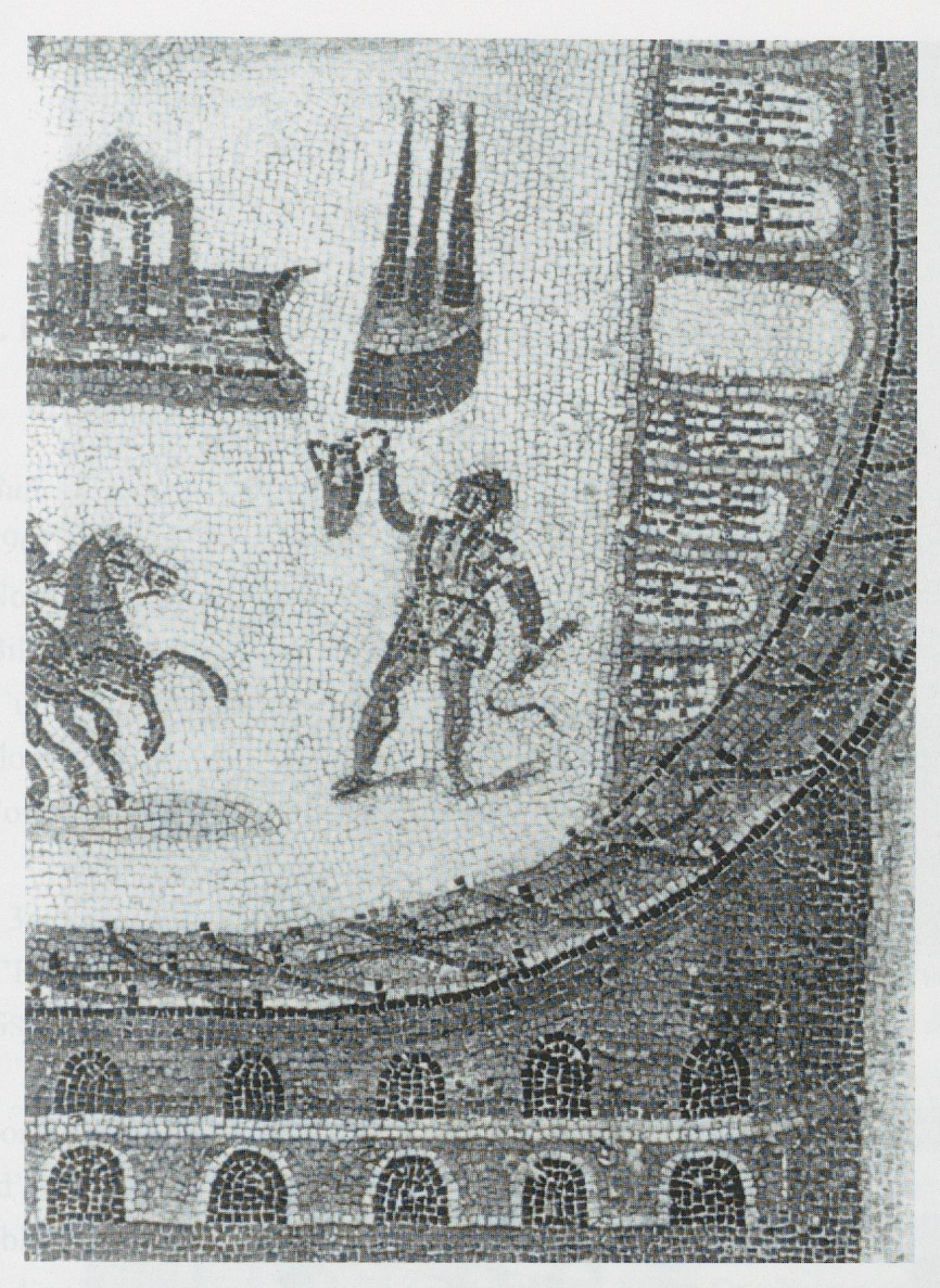
Fig. 3. Circus mosaic from Carthage (detail) (after A. MAR-TIN and G. FRADIER, Mosaïques romaines de Tunisie , Tunis 1986).