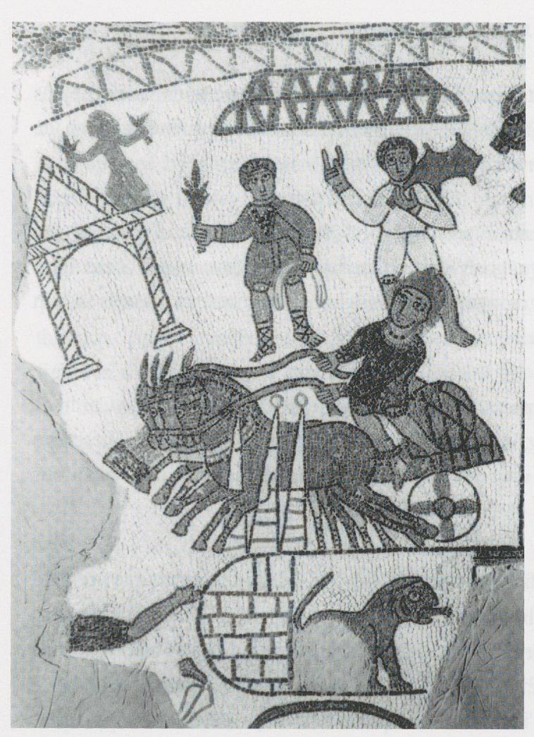
Fig. 1. Circus mosaic from Gafsa (detail) (after A. MARTIN and G. FRADIER, Mosaïques romaines de Tunisie , Tunis 1986).