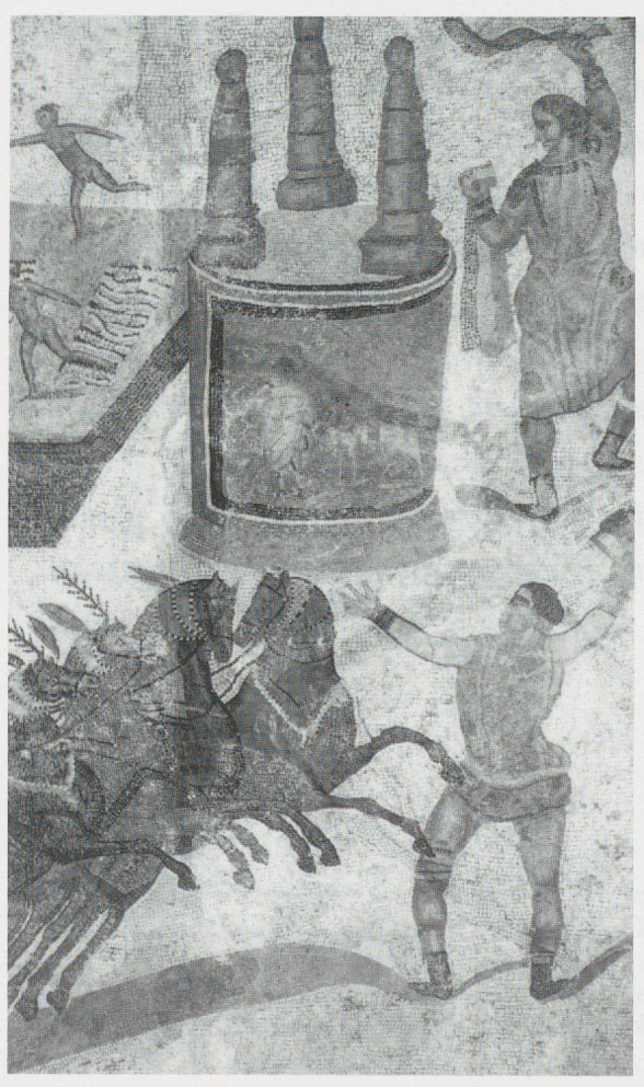
Fig. 2. Circus mosaic from Barcelona (detail) (after B. SMITH, Spain, a History in Art , New York 1966).