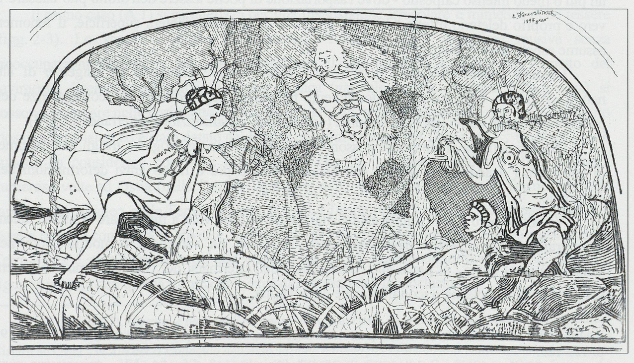
Fig. 3 - The restorations in the mosaic with the depiction of two godesses pouring a libation. St Petersburg, Hermitage.