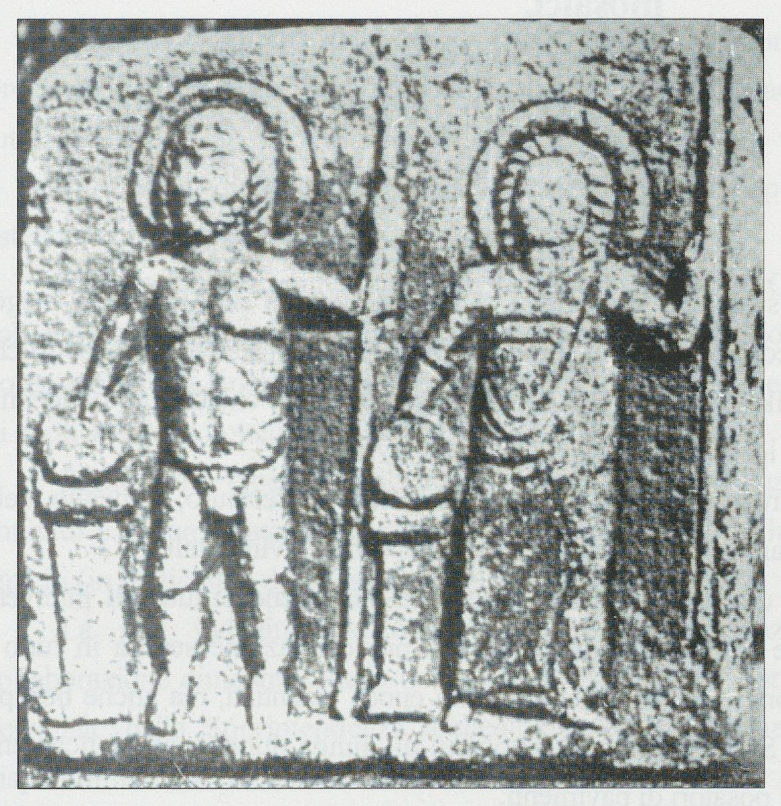
Fig. 2 - Hera and Zeus pouring a libation. After Lexicon iconogra- phicum mythologiae classicae (s.v. "Hera in Thracia", 13).