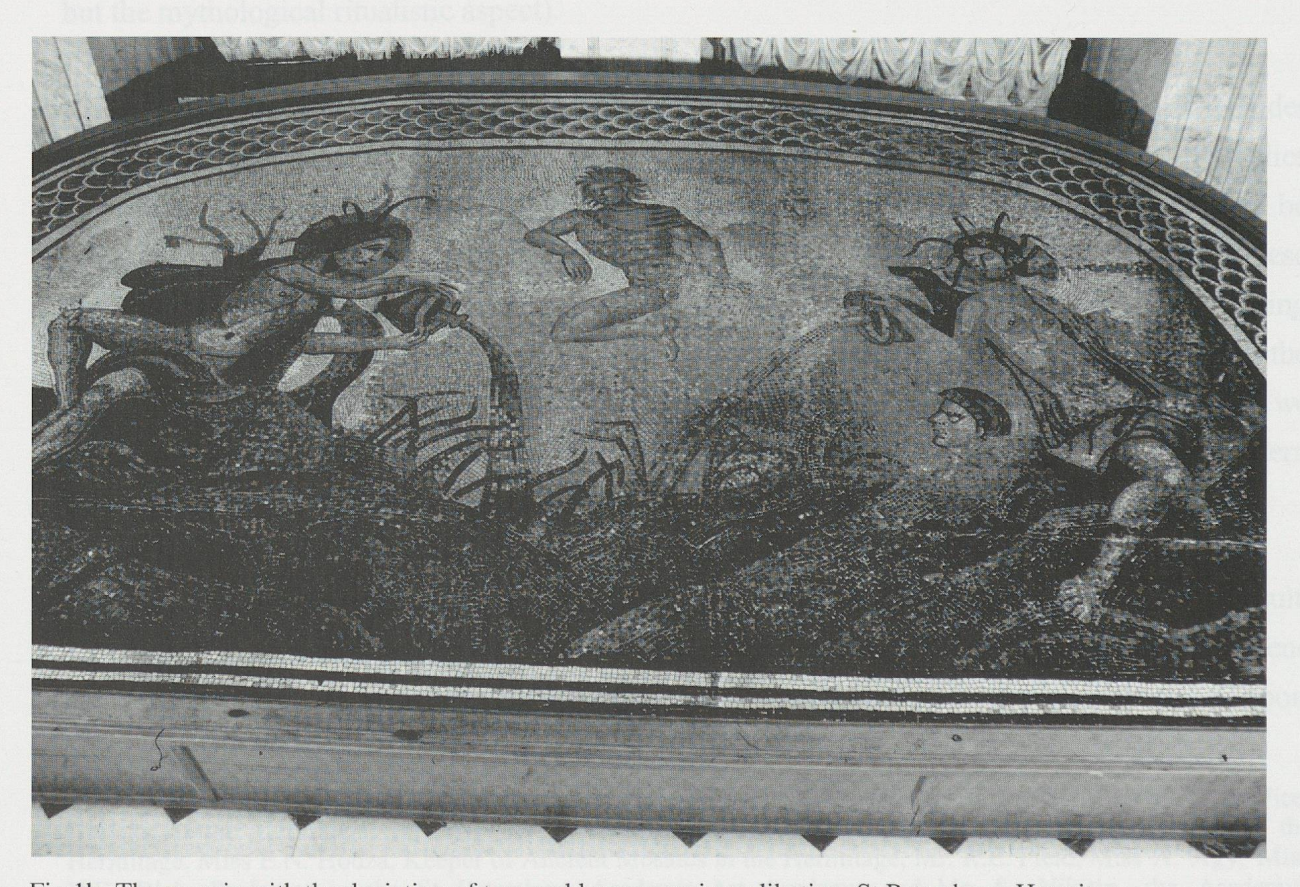
Fig.1b- The mosaic with the depiction of two goddesses pouring a libation. St Petersburg, Hermitage.