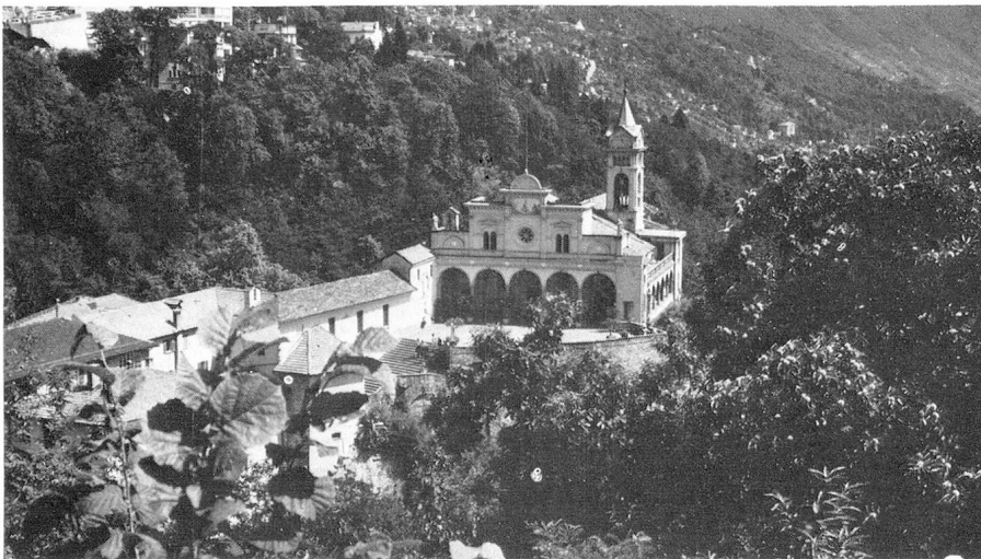
The pilgrimage church of Madonna del Sasso above Locarno

Switzerland first entered literature in songs of battle. Then with the Reformation came a surge of political writing. Broadsheets and moralities or religious plays took the historical situation as their cue. Later nature was discovered, the landscape, the idyll, the earthly Paradise. Into this idyll irrupted the misery of the early industrial age,