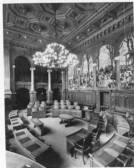
The Chambers of the Council of States in the Federal Parliament Buildings

6. The Federal Office of Justice of the Federal Department of Justice and Police is concerned with matters of international private law, which are obviously most relevant to Swiss citizens abroad. Its activities, however, are confined to legal cases in which the administration is competent; in matters under dispute, the Courts have to decide. Frequently the