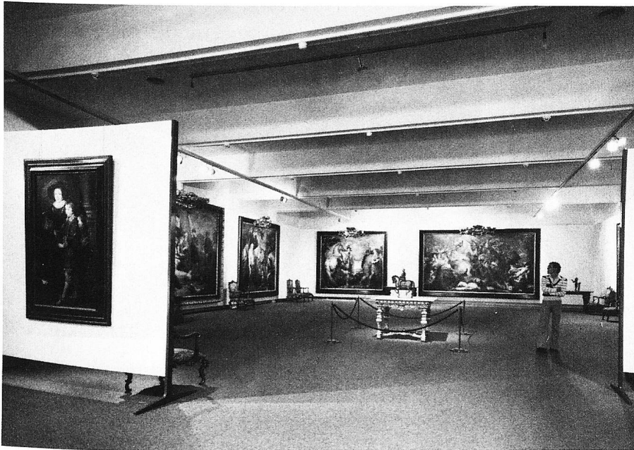
Liechtenstein Art Collections in Vaduz.