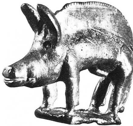
...and rich artwork

The constitution of 1921, which is still in force today, did much to resolve the crisis of identity in which the principality found itself after World War I. The principality became a constitutional hereditary monarchy on a democratic and parliamentary basis. The supreme power is vested in the prince and the people. Prince and people are committed to the constitution. As the supreme authority of the state the prince is answerable to nobody but is obligated to adhere to the constitution and the laws. The prince appoints the government on the motion of the Landtag and also the courts and the highest government officials. Enactments require the sanction of the prince. In emergencies he can rule by emergency decrees. – The people exercise their prerogative by electing representatives to the Landtag and also have an opportunity to participate directly in political decisions by means of the right of referendum and initiative. The Landtag comprises 15 members, who are elected every four years on a proportional basis. It has all the rights and duties of a democratic parliament (legislation, budget, taxation, loans, etc.). The government, comprising a prime minister and