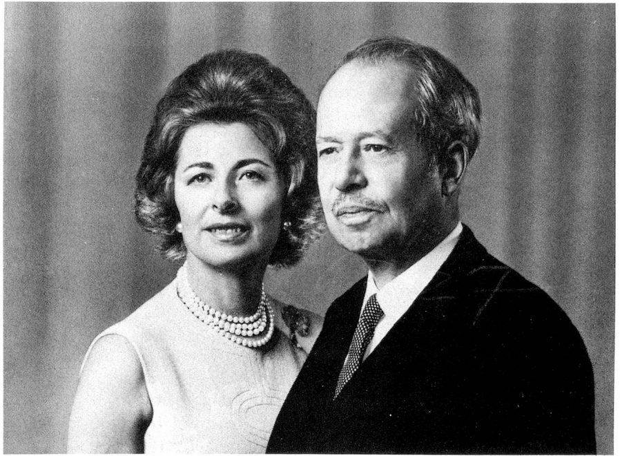
The Prince and Princess of Liechtenstein

1960. He was thinking, prematurely as it happens, in terms of basic patterns which are peculiar to evolution and by conforming with which those systems that are sufficiently remote from the statistical mean may look forward to a growing diversification and wealth of forms.