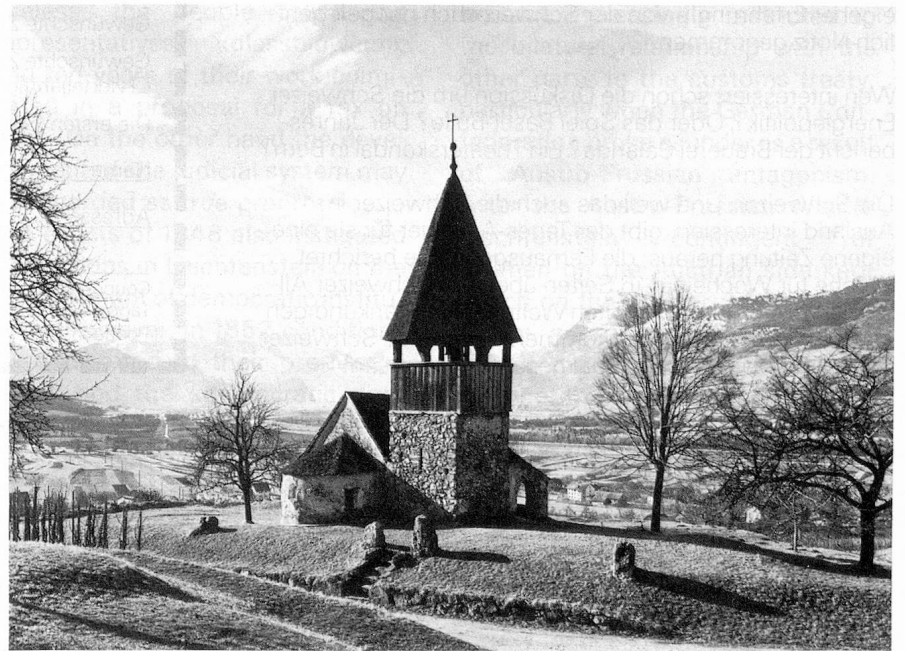
The church at Triesenberg

noble lineage which can be traced back to the 12th century and whose influence increased in Vienna particularly in the 16th and 17th centuries. In spite of the family's extensive possessions there were no territories which were immediate fiefs of the Emperor such as were necessary for obtaining a seat and a vote in the Council of the Princes of the Empire. Hence Hans Adam Andreas von Liechtenstein, the great baroque patron of the arts and brilliant economist, acquired in 1699 the lordship of Schellenberg, which was immediate to the Emperor, and in 1712 the county of Vaduz. In 1719 Emperor Charles VI raised both territories to the status of an immediate imperial principality with the name of Liechtenstein (343rd member of the Holy Roman Empire). In its domestic affairs there followed a tightening of the administration in the spirit of an absolutist, authoritarian polity of grace ordained by God. The old landamman constitution was undermined, but the elected representative of the people was left with the empty shell of ceremony during court sessions. The French Revolu-