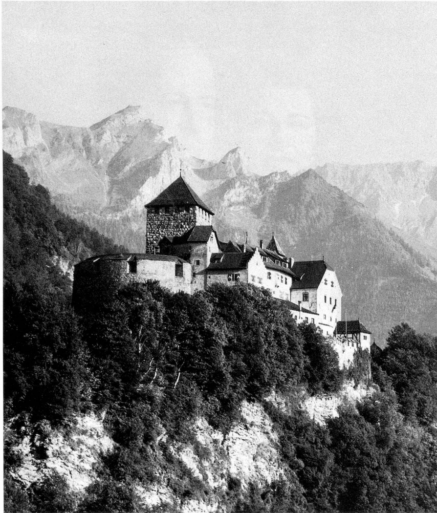
Vaduz Castle

known as the Melaun culture. The western offshoot of the Melaun culture was located in our area. It seems highly likely that ancient Rhaetia, an entity which is very difficult to define historically, was coterminous with the region in which Melaun ware is deposited. Archeological evidence exists of continuous settlement in the Liechtenstein region during the various phases of the Iron Age. The later Latène culture (c. 500–15 BC) left on the Eschnerberg, which has already frequently figured in our text, a very specific pottery recorded in the archeological textbooks as Schnell pottery. Mention must also be made of the highly significant bronze figures of Gutenberg dating