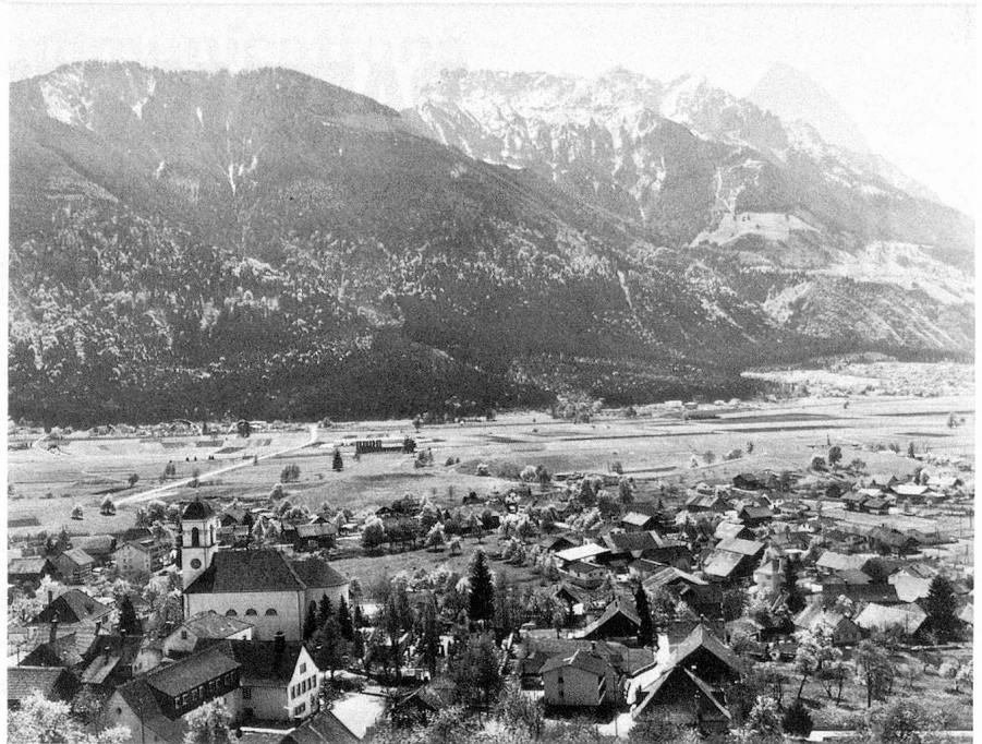
Liechtenstein is a country with great variety in scenery...

From 1805 onwards Prince John I was the leader of the small country and the destinies of the lineage. This legendary commander, whom Metternich described as being born for the profession of arms, survived more than one hundred battles and skirmishes, and his name is associated with almost all the campaigns against Napoleon. His opposition to Napoleon earned him the latter's respect. When on 12th July 1806 the Confederation of the Rhine was formed – an area roughly the size of the modern Federal Republic of Germany – Liechtenstein was also named a sovereign member of the Confederation. Napoleon himself asserted that he held no prince of the Confederation in higher esteem than the Prince of Liechtenstein. After a history of 1000 years the old Empire came to an end. By virtue of the great influence wielded by its prince, Liechtenstein survived the waves of mediatization which simplified the chequered maps of Central Europe. In the sovereign principality, however, the last democratic rights at the national level were abolished. New, effective laws came into force (Austrian Civil Code, land register, first school law, etc.). The little country was reoriented throughout. Immediately after Napoleon had quit the world scene and the Confederation of the Rhine had been dissolved (1813), the prince paved the way to the Congress of Vienna and to membership of the German Confederation. The German Confederation saw itself as a union of sovereign princes and cities of