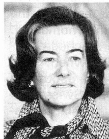
Monique Bauer Councillor of States