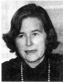
Elisabeth Kopp Federal Councillor