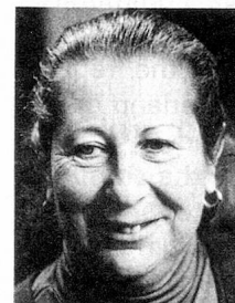
Amélia Christinat National Councillor