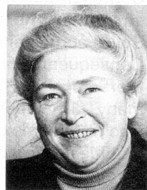
Esther Bühler Councillor of States Member of the Commission of the Swiss Abroad