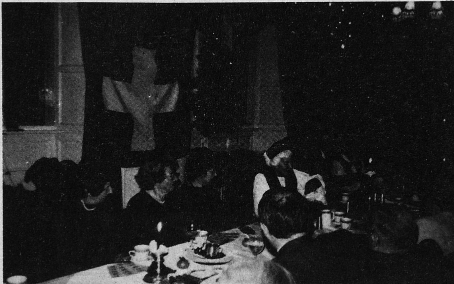
Christmas Party – Paignton

Our club had a very successful year with lots of meetings. We meet twice a month for coffee and once for a social evening according to our programme. It is usually in the Odd Fellows Hall. We also have slide evenings, Raclette evening, games or just a drink in a Pub. Our new programme will be out shortly which will have our Annual General Meeting in March followed by some theatre, film evenings etc. and of course 1st August Feier on it.