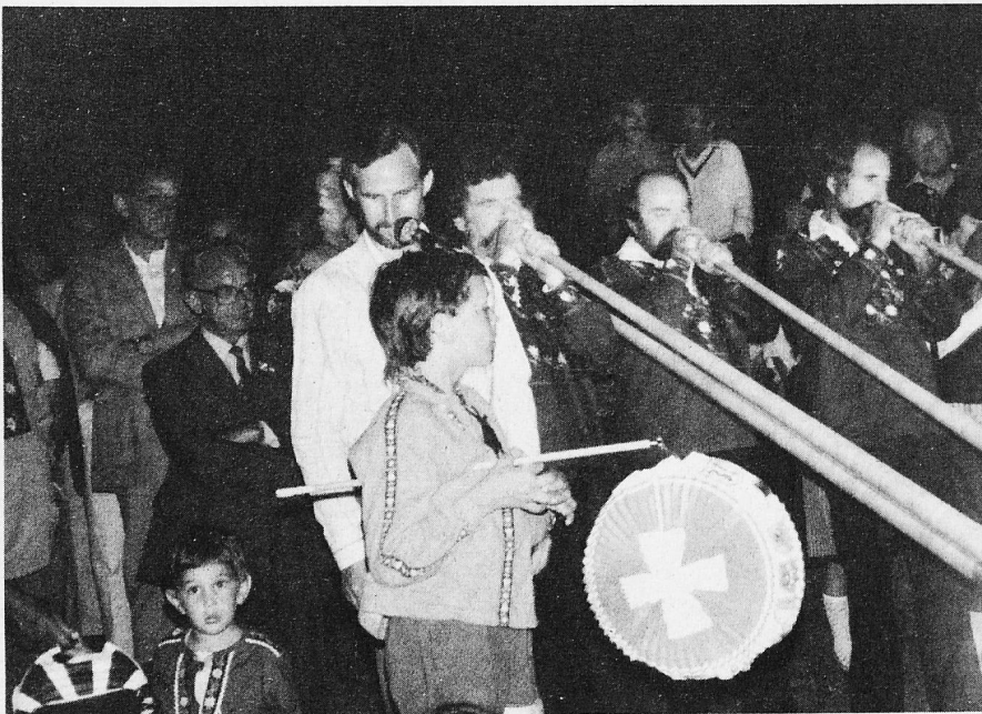
The Alphorn Quartet performing for large and small.

(Kloten), which kept everybody on the dance floor till the wee hours.