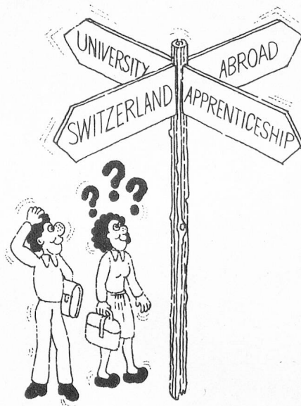
Taken from: Wegweiser zur Berufswahl; Editor: Reinhard Schmid, CH-8185 Winkel

A training in Switzerland: the desire and ideal of many. But ideal and reality do not always coincide. The picture which many young Swiss abroad and their parents have of Switzerland, its training system and its world of work is miles away from the reality of present-day Switzerland. Anyone who wants to avoid unpleasant surprises later would therefore do well to become thoroughly informed on the subject: one to two years before the proposed training period those wishing to train and their parents