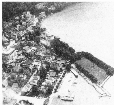
The «Place of the Swiss Abroad» will be created here: the little peninsular lying picturesquely in the bay of Brunnen

A tree-covered piece of land jutting into the bay of Brunnen, lying directly opposite the Rütli, presents itself as the ideal location for the Place for the Swiss Abroad. The place, incidentally, forms the termination of the planned Path of Switzerland round the lake of Uri. The Place will continue to exist beyond the jubilee of 1991 as a permanent symbol of the attachment and affection of the Swiss abroad for their old homeland, and as a meeting place. Just as, 128 years ago,