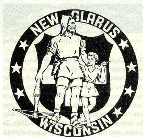
...on a World tour (Swiss settlement New Glarus in the U.S.A.)...

Tell's active political engagement is rather irritating. He fought for, as well as against, a Swiss entry into the UN. He has voted for the Communists on several occasions,