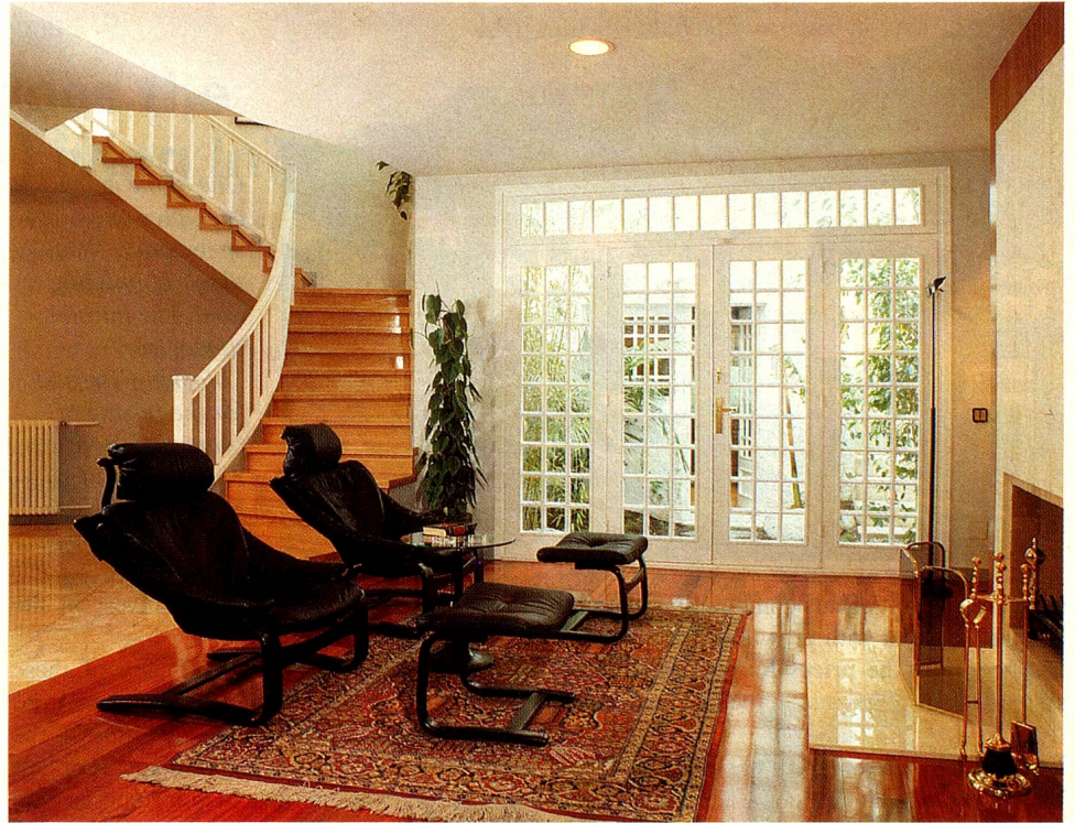
During the past 20 years the available unit surface of apartment per person has increased by more than 20 square metres.

Area Planning can – and should – make a contribution towards the easing of the problems of the property market. Admittedly, its