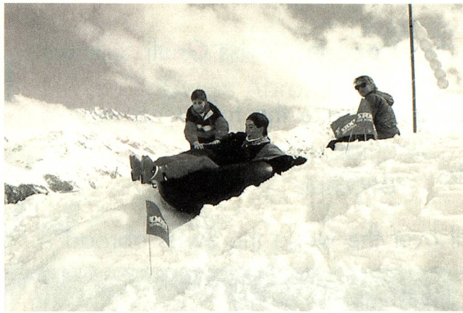
Fun and games are the best part of SSA camps.

So in future Swiss students from abroad have the same status in Swiss universities