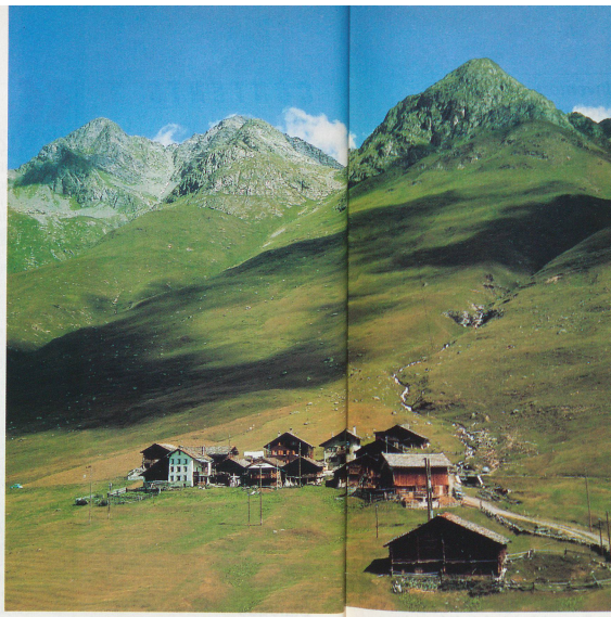
Juf in the Averser valley (Canton Grisons), a Walser Settlement at 6,998 feet, the highest permanently inhabited village in Europe.

The ability to lay out a vast and highly efficient transport system throughout the huge empire is certainly one of the most fascinating aspects of the Roman achievement in building, planning and technology. The best original information about the course of the Roman roads, and particularly the important stage points along them, is found in the "Itinerarium Antonini", a Roman handbook for travellers, and the Peutinger