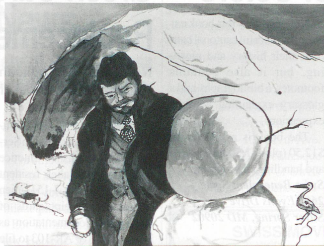
Inspection Medical Hermeneutics: "Switzerland + Medicine" Panel from Lenin's Corridor

The first exhibition this year analyzed how Swiss culture is viewed abroad, more specifically in the former Soviet Union: The Russian artist group "Inspection Medical Hermeneutics" installed a far-reaching work examining the impact of Swiss institutions like the Red Cross and the role that Zurich played for Russian refugees, among other topics. The result was a humorous and challenging installation that was reviewed extensively in the international media.