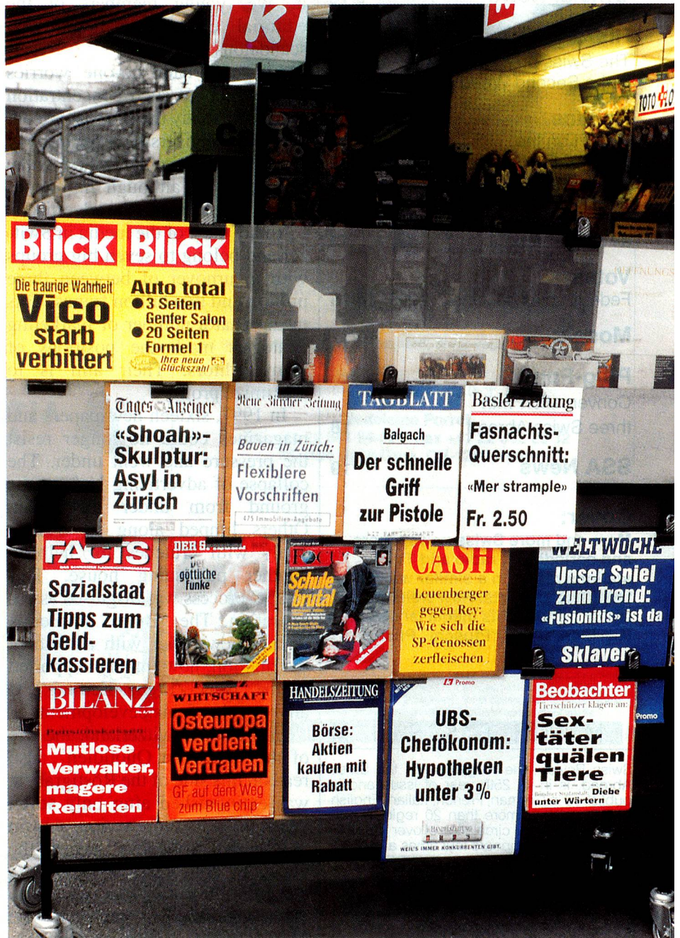
The fight for readership: newspapers on sale in German-speaking Switzerland.

But there were also the electronic media, which gradually pushed the daily press away from its position as a leading political medium.