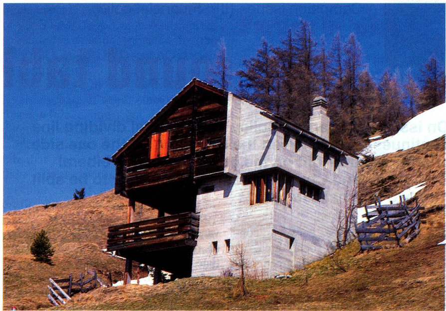
The vote in favour of a revision of the Land Planning Law facilitates the redeployment of agricultural buildings.

"One can interpret the result in different ways, but there is no escaping one central fact. The electorate apparently sees no value in awarding itself tax benefits unnecessarily. Period."