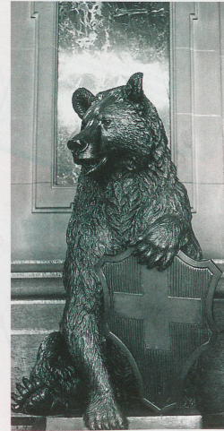
Political as well as wild animals lock horns in parliament.

It is unlikely that the consensus system will be replaced by a purely competitive system. The latter is alien to Switzerland's political culture and is difficult to blend with direct democracy. One possible solution would be the formation of a parliamentary majority with a shared legislative programme.