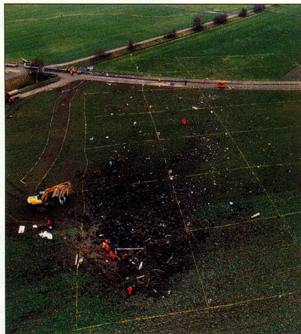
The Crossair Saab 340 crashed near Niederhasli (ZH) shortly after takeoff.

A SAAB PASSENGER PLANE crashed in Niederhasli near Kloten. The Crossair Cityliner plunged into a field shortly after take-off and caught fire, killing all ten on board. The three crew members (including the Moldavian captain and Slovakian co-pilot) and seven passengers were on their way to Dresden. The cause of the crash is still being investigated. This was the first crash in the 21-year history of SAir subsidiary Crossair.