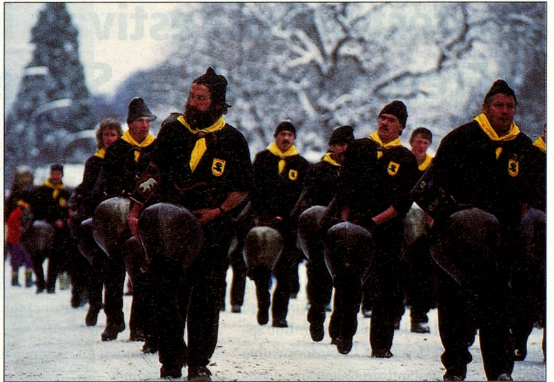
On the evening before New Year's Eve, "Trychler" march through the villages of Oberhasli.