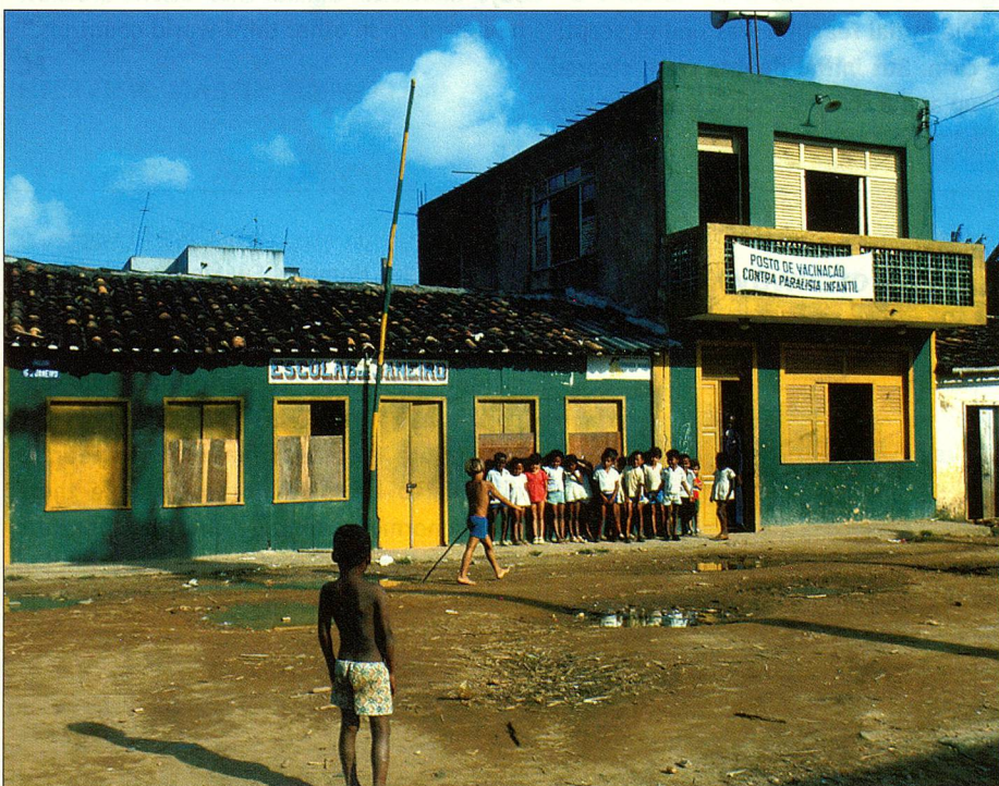
Poverty has many faces. Slum near Sao Paulo.