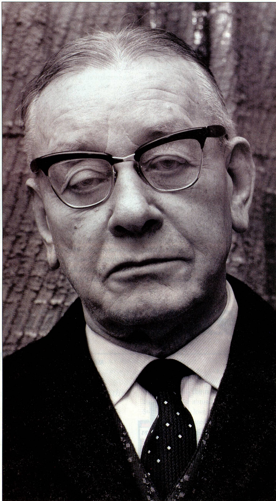
Paul Grüninger, the St. Gallen police chief who in 1938/39 allowed Jewish refugees to enter Switzerland in defiance of the regulations.

The best-known case of persons who were accused of crimes after saving the lives of thousands of Jews in 1939 was St. Gallen policeman Paul Grüninger, who was pardoned only in 1996 by the St. Gallen district court. In 1939 Grüninger was summarily dismissed and in 1940 was found guilty of dere-