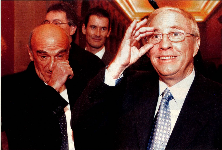
As Christoph Blocher (right) blinks in the limelight, Hans-Rudolf Merz wipes away a tear.

Democratic centrist Christoph Blocher and radical Hans-Rudolf Merz are the new faces in the Federal Council, which was elected on 10 December. By choosing a second UDC member to replace Christian Democrat minister Ruth Metzler, Switzerland's Federal Assembly has broken a political balance of 44 years' standing (see "editorial" page 3).