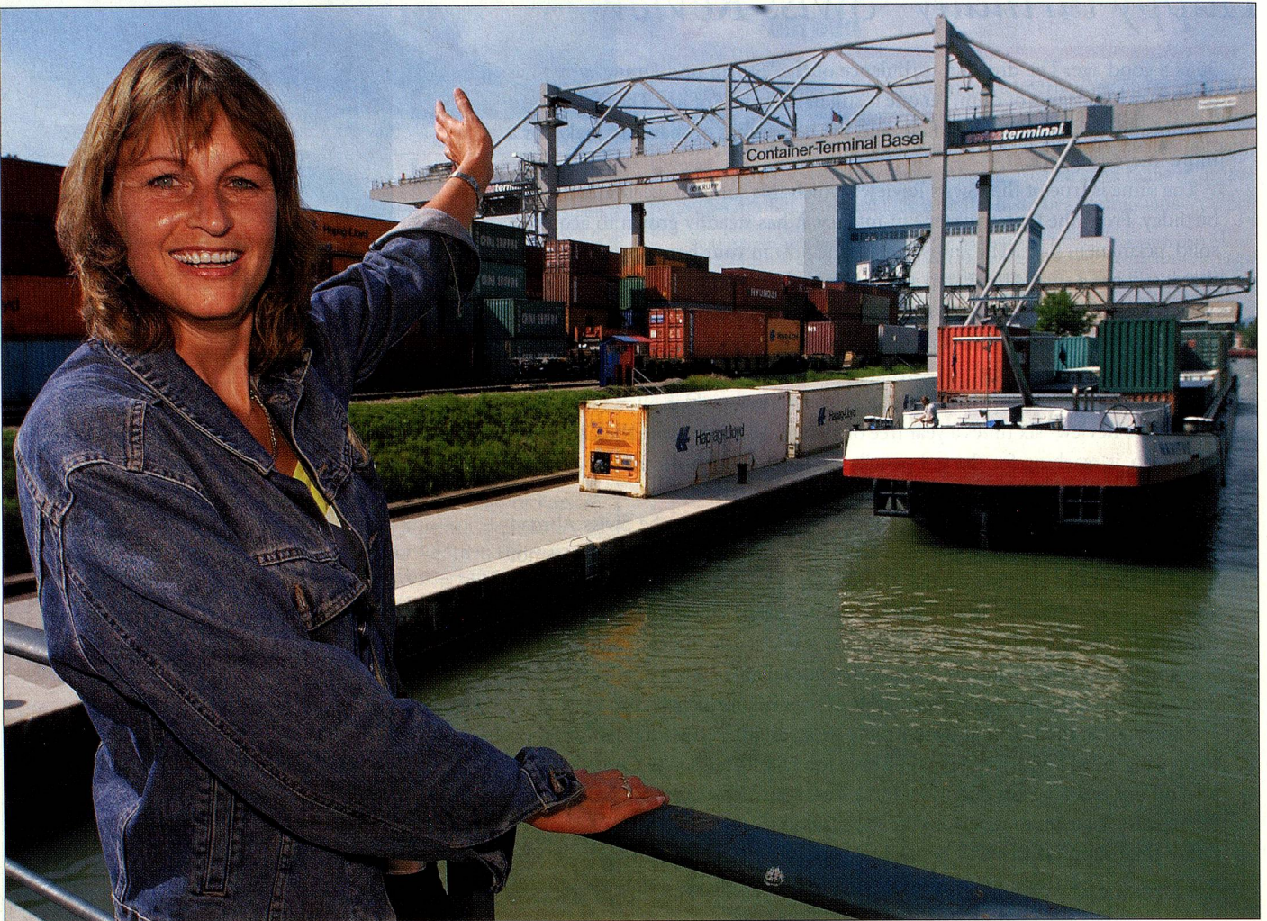
As the household effects leave the Rhine port in Basle, their owner takes a courageous step into the big wide world.